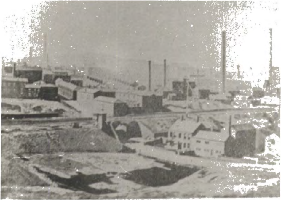
OLDHAM FROM GLODWICK, 1860