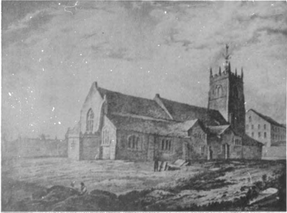
NORTH-EAST VIEW OF THE OLD PARISH CHURCH OF OLDHAM