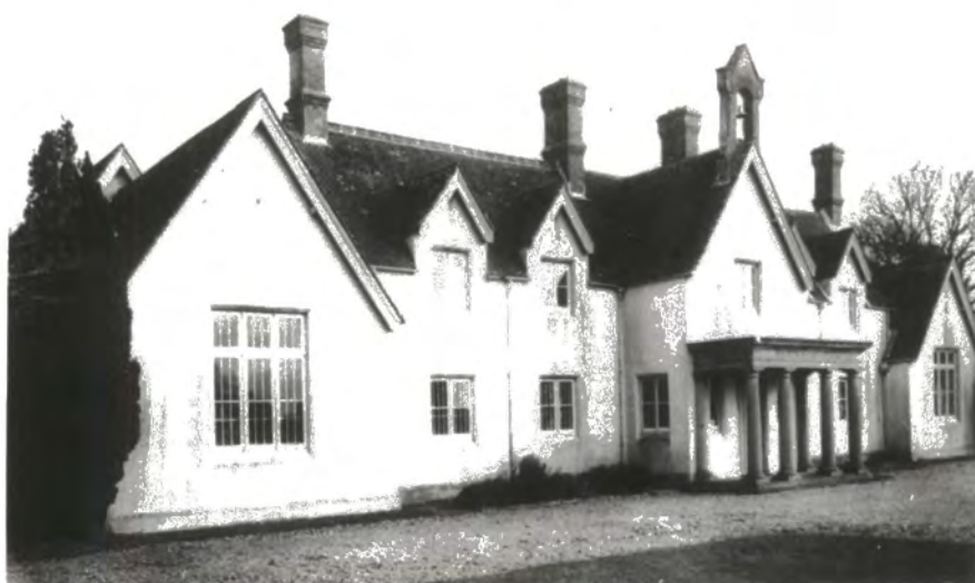
The Gipsy School, started in 1845 (until recently the Pitt-Rivers Museum)