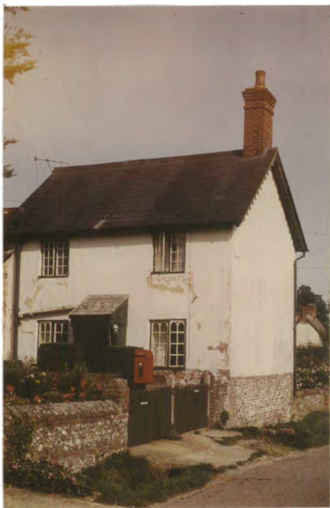
The village schoolmistress's house, 1845