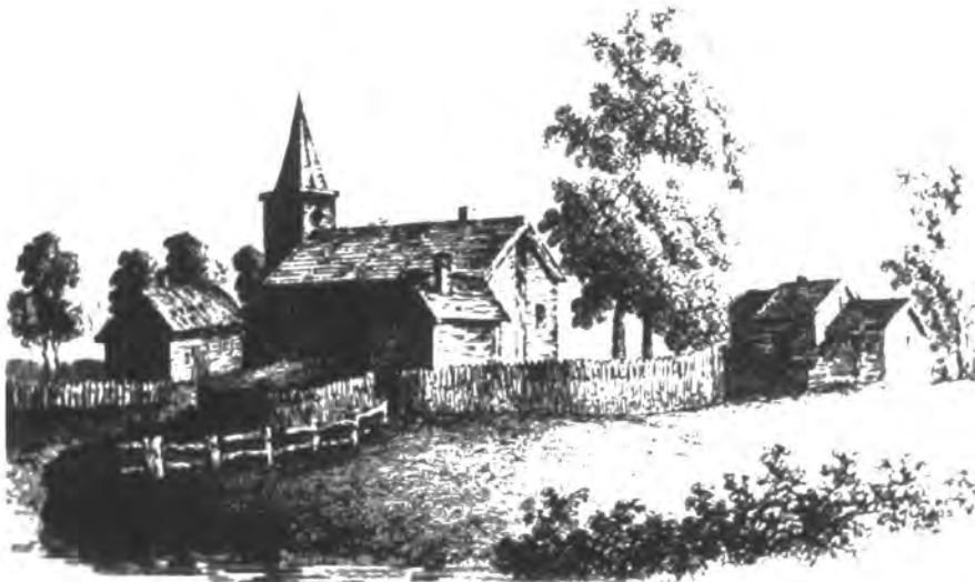
The mission church and school