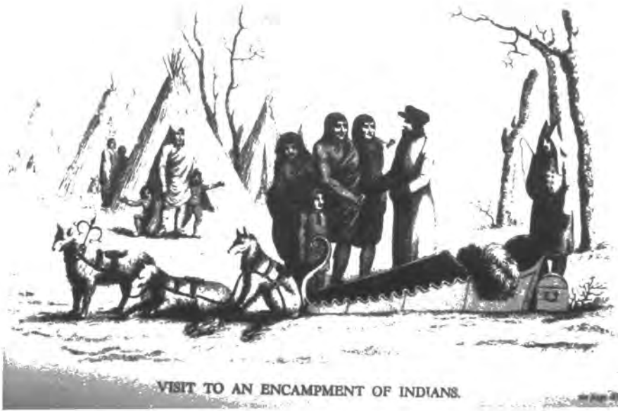
West with carriole