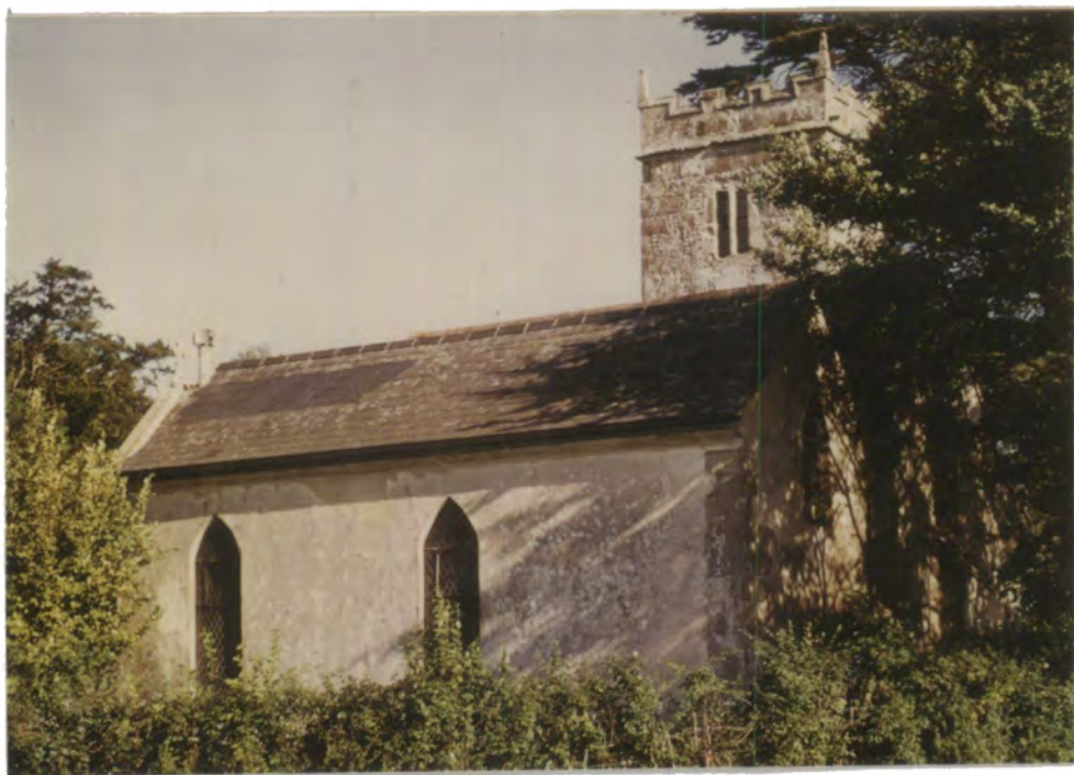
The extension to the church of St Laurence, 1835