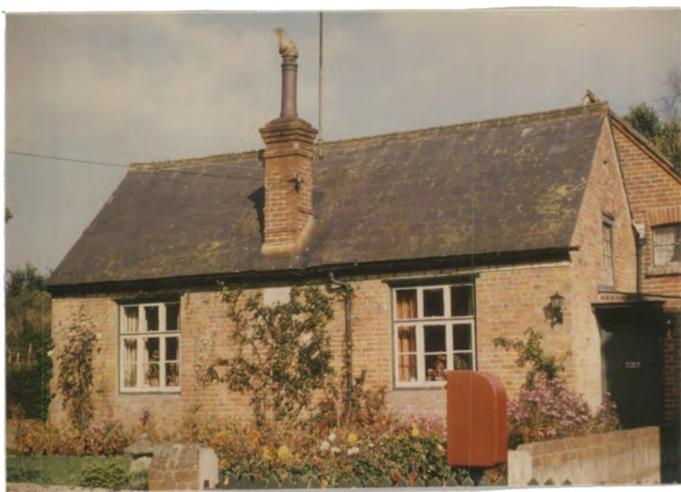
The village school (now the Post Office), 1837