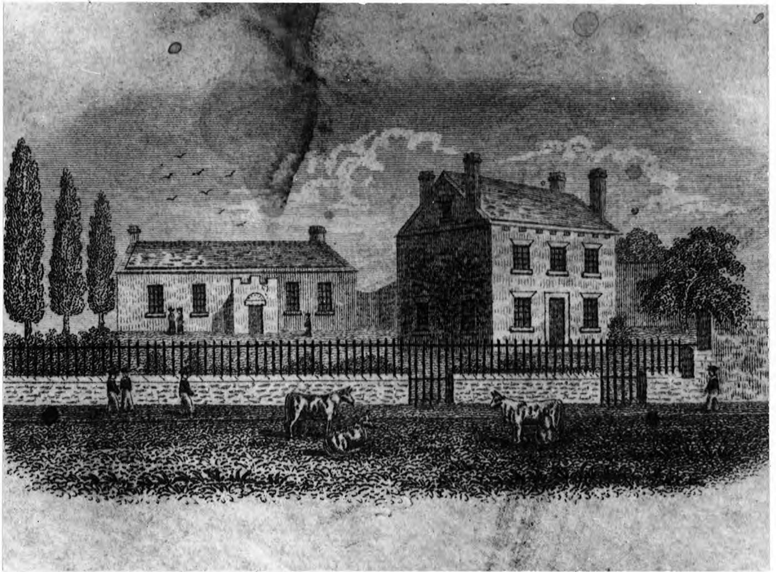
Senior's Academy, Church Fields