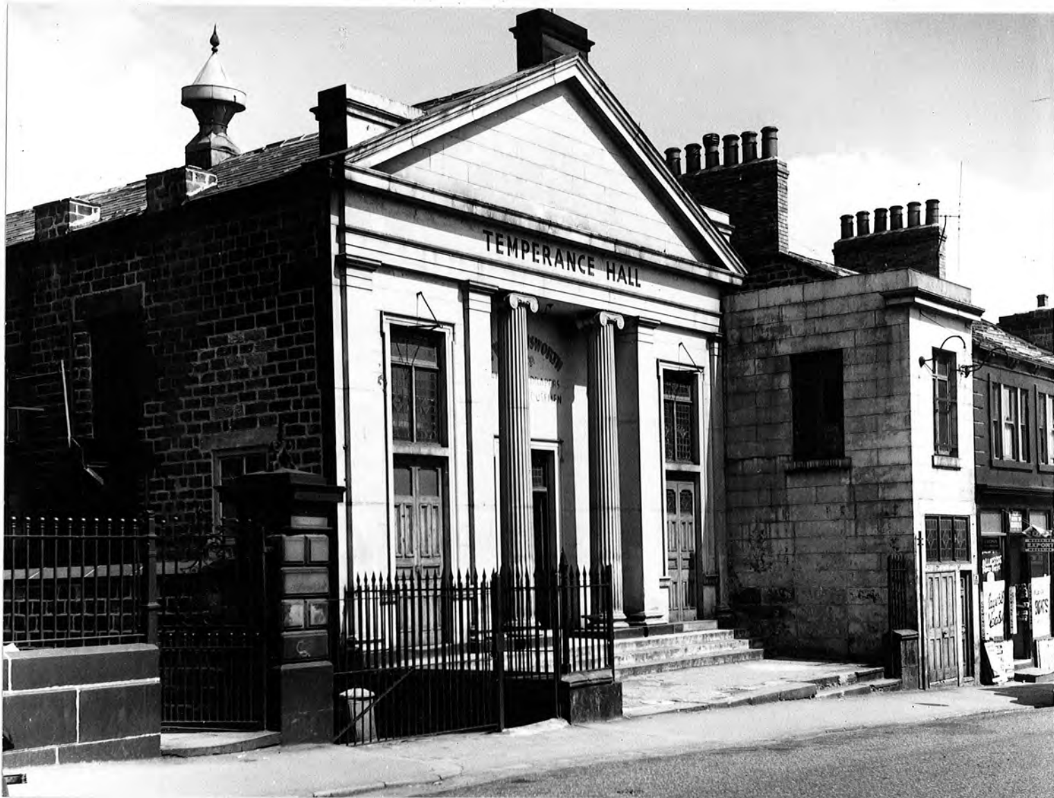
Temperance Hall. 1850