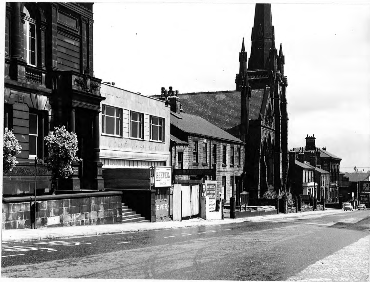
Regent Street Chapel.