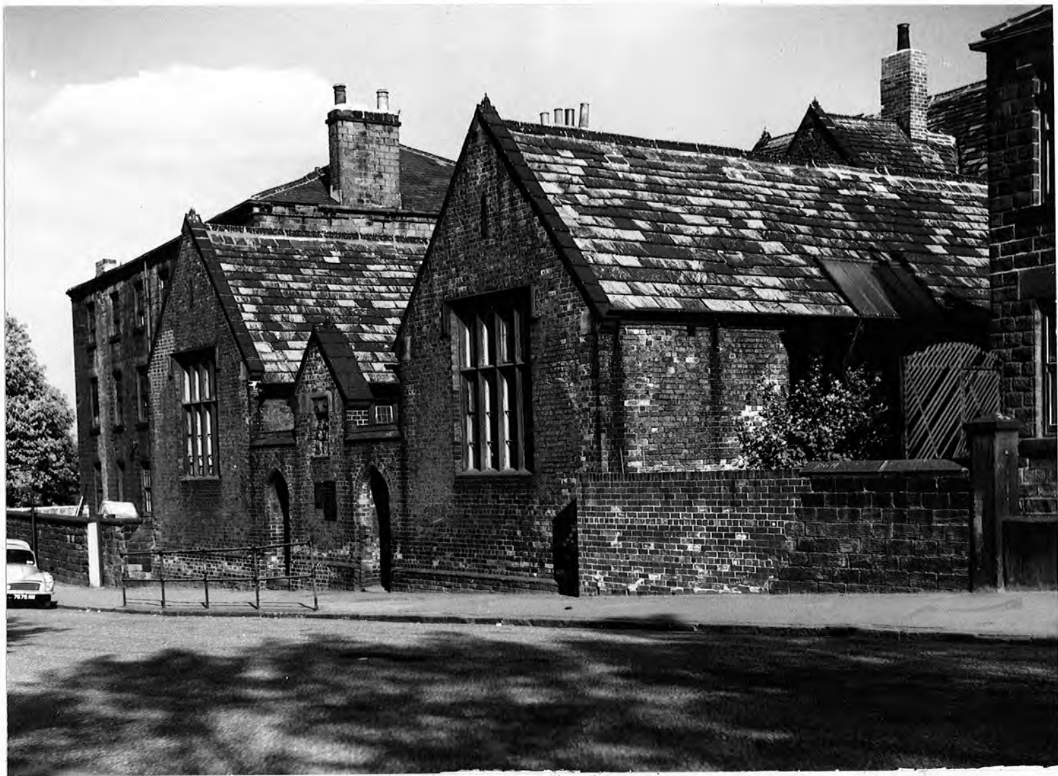
St. Mary's School .