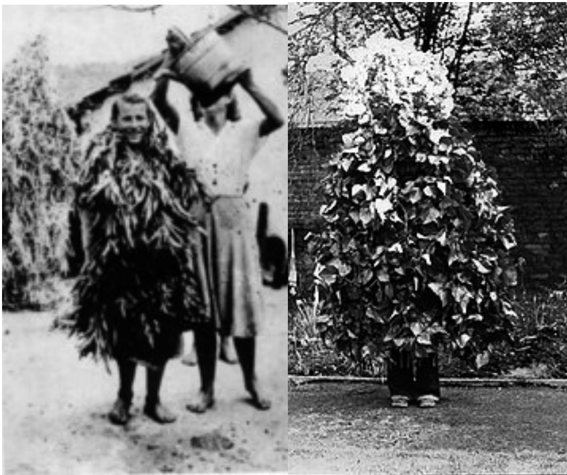
Left, Dodola, Western Serbia 1957. Right, Jack of the Green, Kensington 1976 224