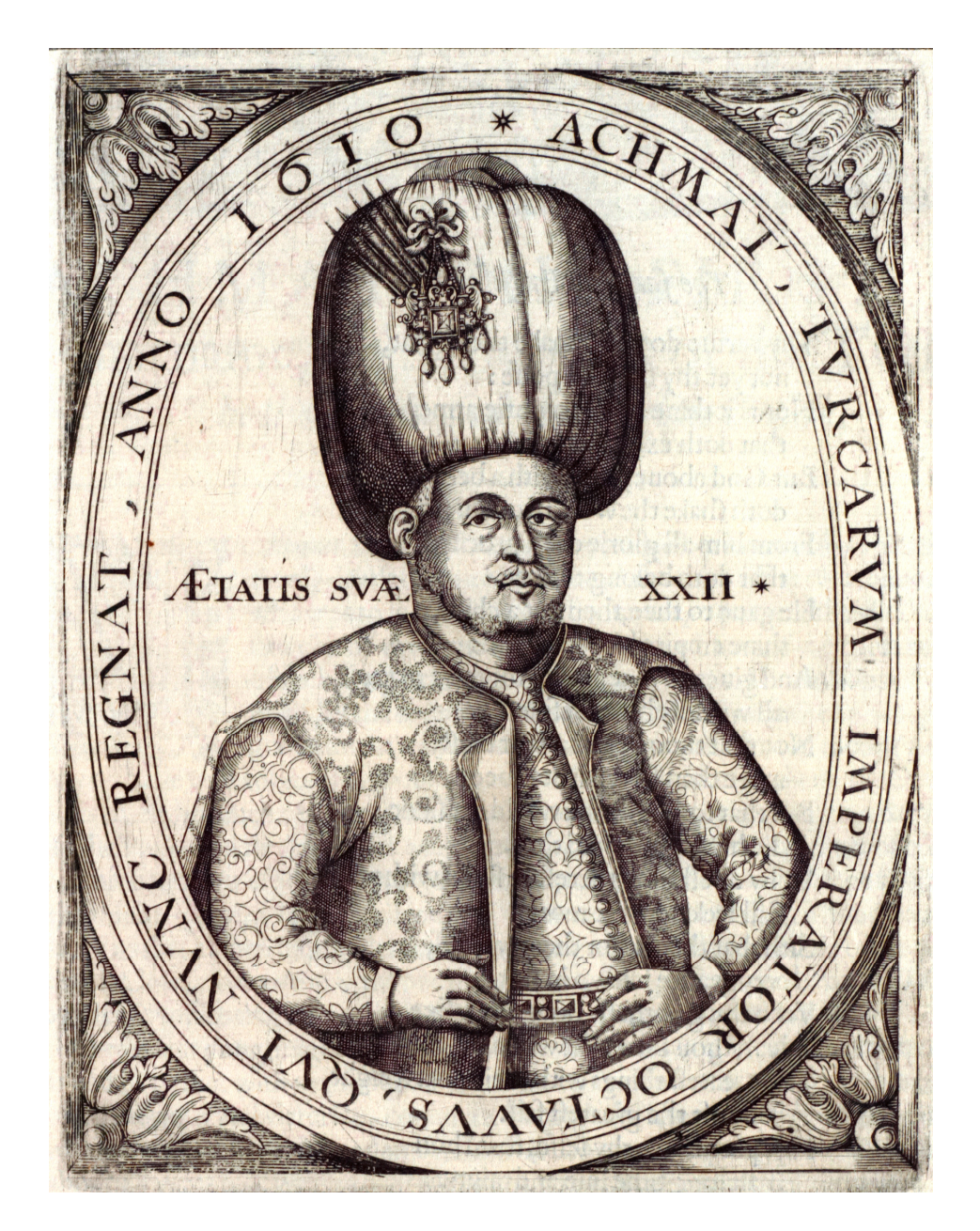
Figure 1: 'Achmat, the first of that name, eight Emperour of the Turks' Knolles, History (1610), p. 1203, by kind permission of the Trustees of the National Library of Scotland.