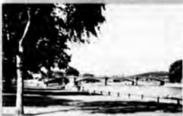
Trent Bridge from Victoria Embankment

SEASIDE RESORTS AND HOLIDAY CAMPS ON NEIGHBOURING EAST COAST.