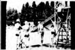
Open-air Bath, University Park