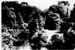
The Japanese Garden, Newstead Abbey