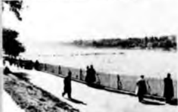
Nottingham Forest Recreation Ground