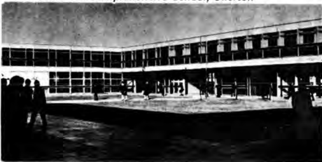
The Dukeries Comprehensive School, Ollerton