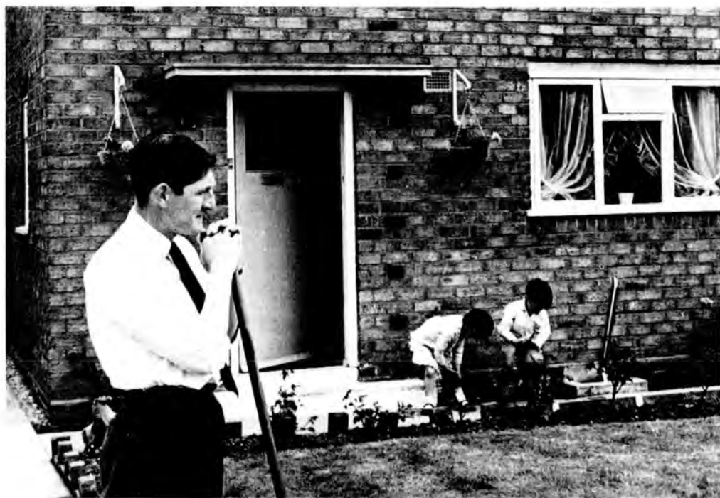
Father and Sons, Cannock