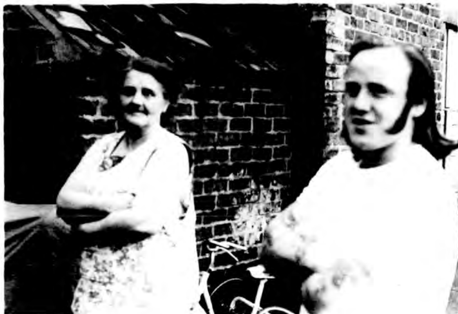
Mother and Son, Esh Winning