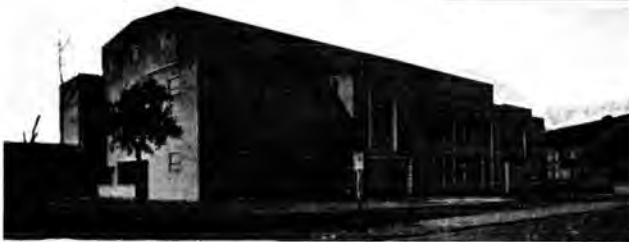
Ollerton Miners' Welfare