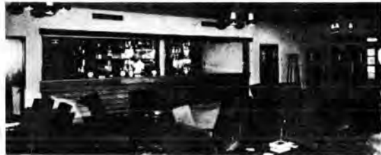
Lounge & Bar

The Nottinghamshire County Council provides comprehensive maternity and child welfare services at Ollerton.