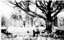
Deer in Wollaton Park