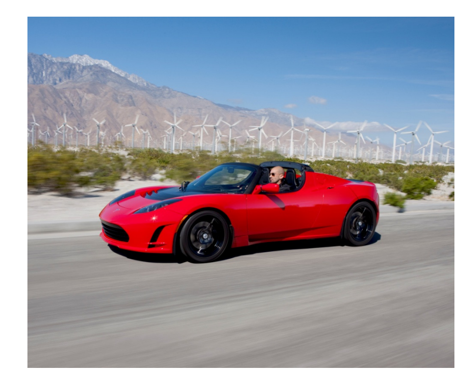
Fig 1.2 – A Tesla Roadster. One of the more well-known EVs available to buy today.