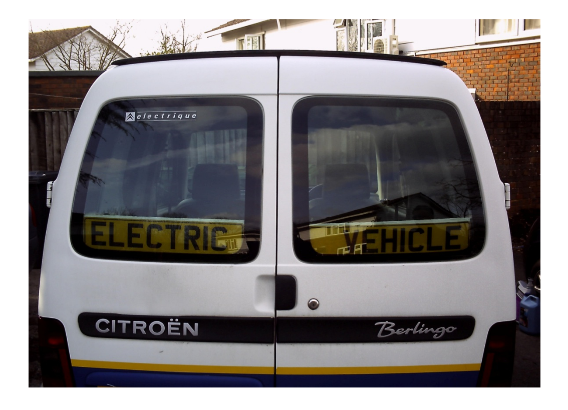
Fig 5.1 A vehicle with a notice informing people behind it is powered by electric

I would actively dislike that – the whole 'it's an electric car!' thing - apart from anything else I think..... the normalisation of the technology is going to depend on it not being people who paint everything bright yellow and have a big arrow that says 'Look at me, I'm driving an electric car!' or whatever.