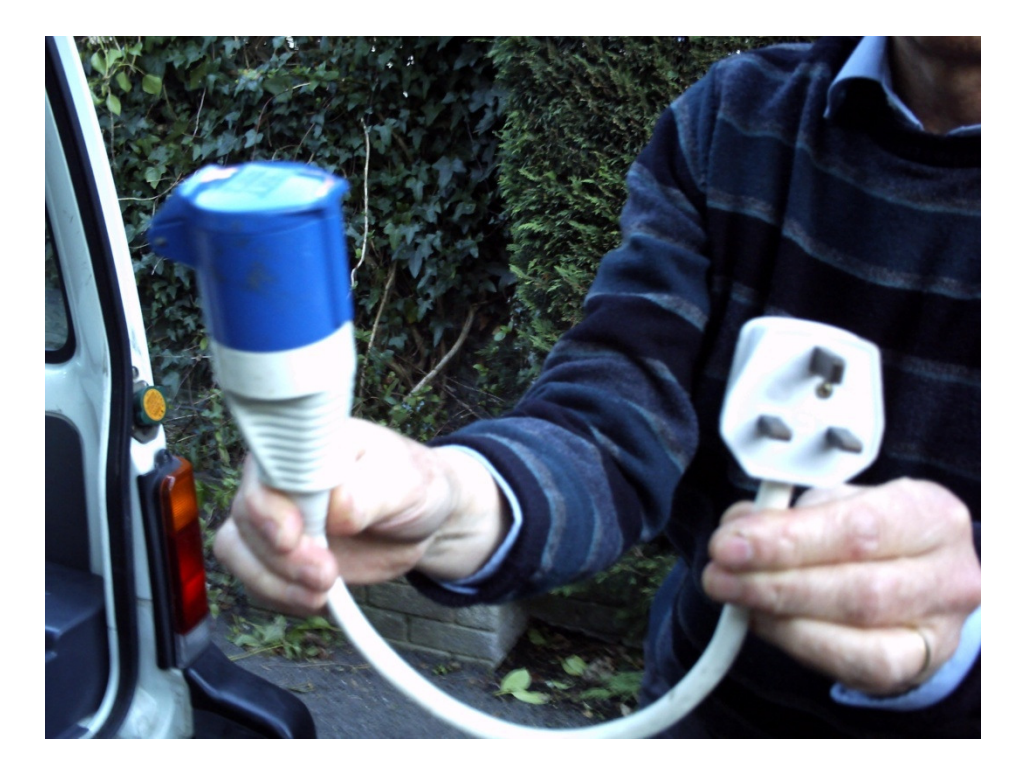
Fig 6.2 - A driver displays a 16-amp to 13-amp adapter. Most drivers in the study carry this simple piece of kit at all times.

supply is minimised. Some have installed a separate meter on the line serving the EV, so they can observe, mainly out of interest, how much electricity the vehicle uses.