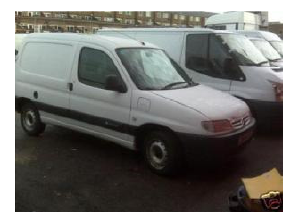
Fig 6.4 – A Citroen Berlingo Electrique. Looks like any other small workman's van.

In the study, eight households own at least one Berlingo Electrique. All use them as personal vehicles for domestic use, and those that are self-employed also use them for business errands, though only one is actually a tradesman (part-time electrician). None use