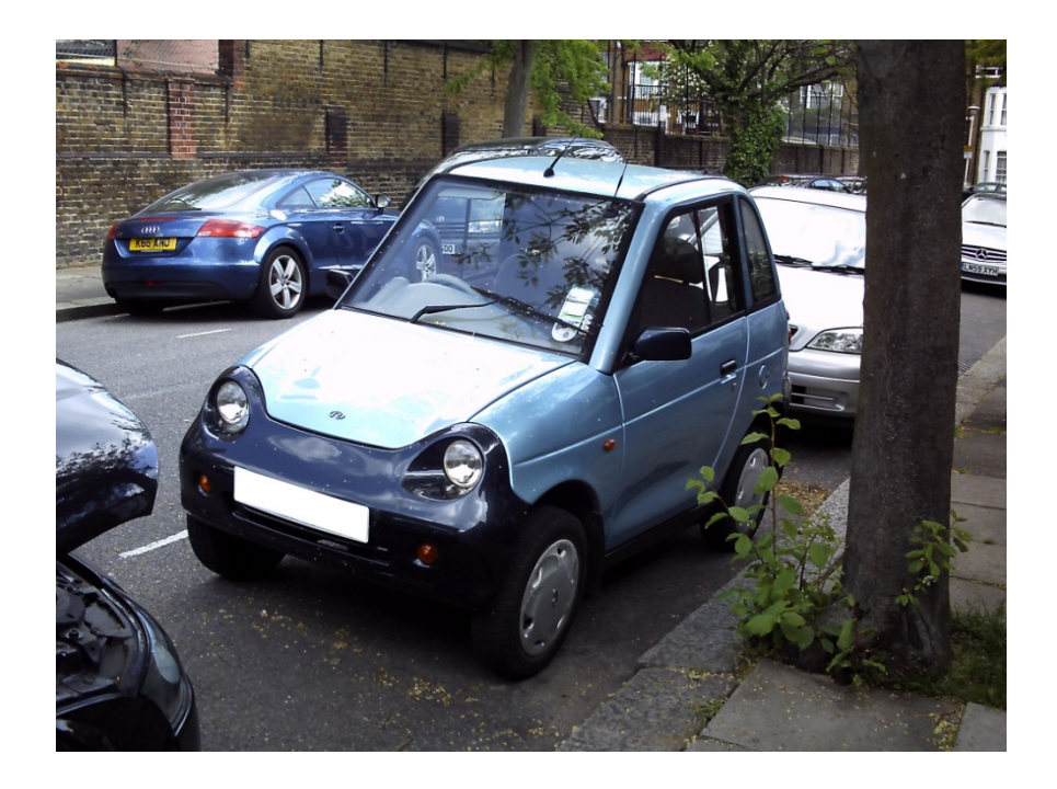
Fig 1.3 – A Reva G-Wiz. The biggest selling EV in the UK up to 2010. It is legally a 'quadricyle'.