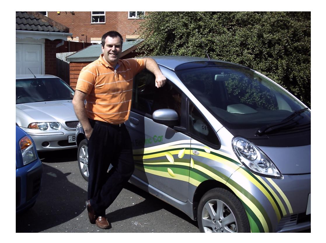
Fig 1.1 – A driver with his on-trial Mitsubishi iMiev

The only fully electric vehicle to have any impact in the way of numbers is the Reva G-Wiz, which number around 1000, with the majority of these being in and around London - this is still a minority product, even in the UK's so-called 'electric car capital'. Electric vehicles are few and far between and the electricity used to recharge them barely registers as a blip on the UK's National Grid.