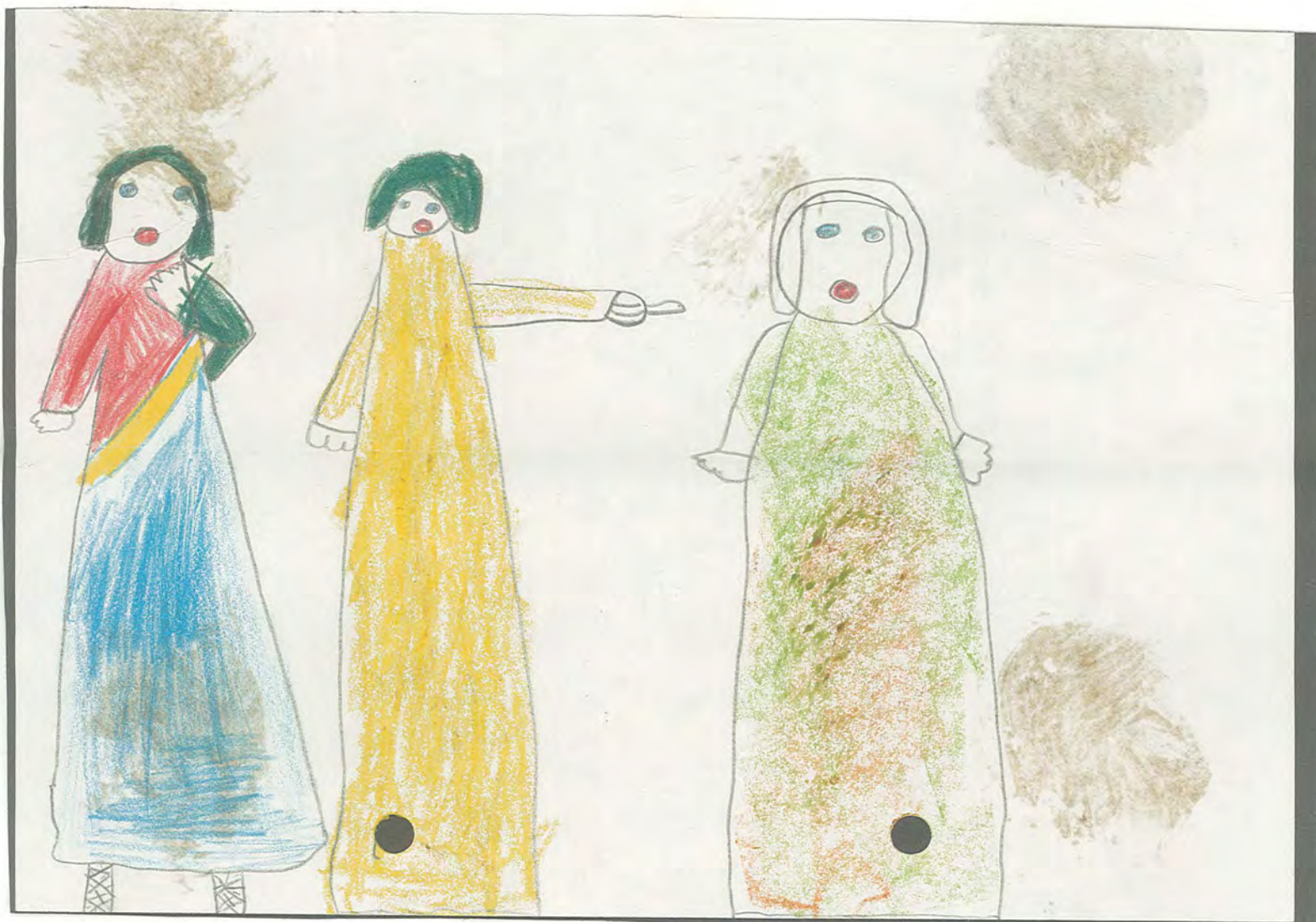
Figure 8. Expressions of the disciples show what they were feeling on the first Whitsunday.