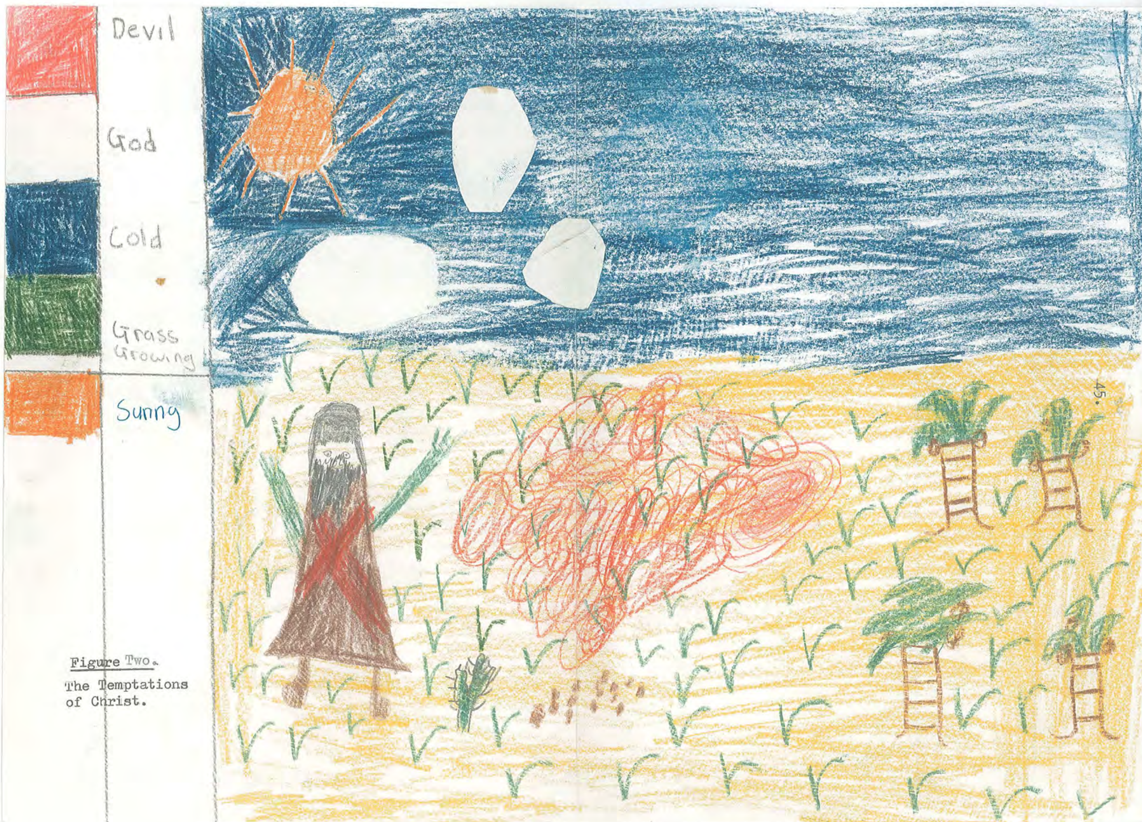
Figure Two. The Temptations of Christ.