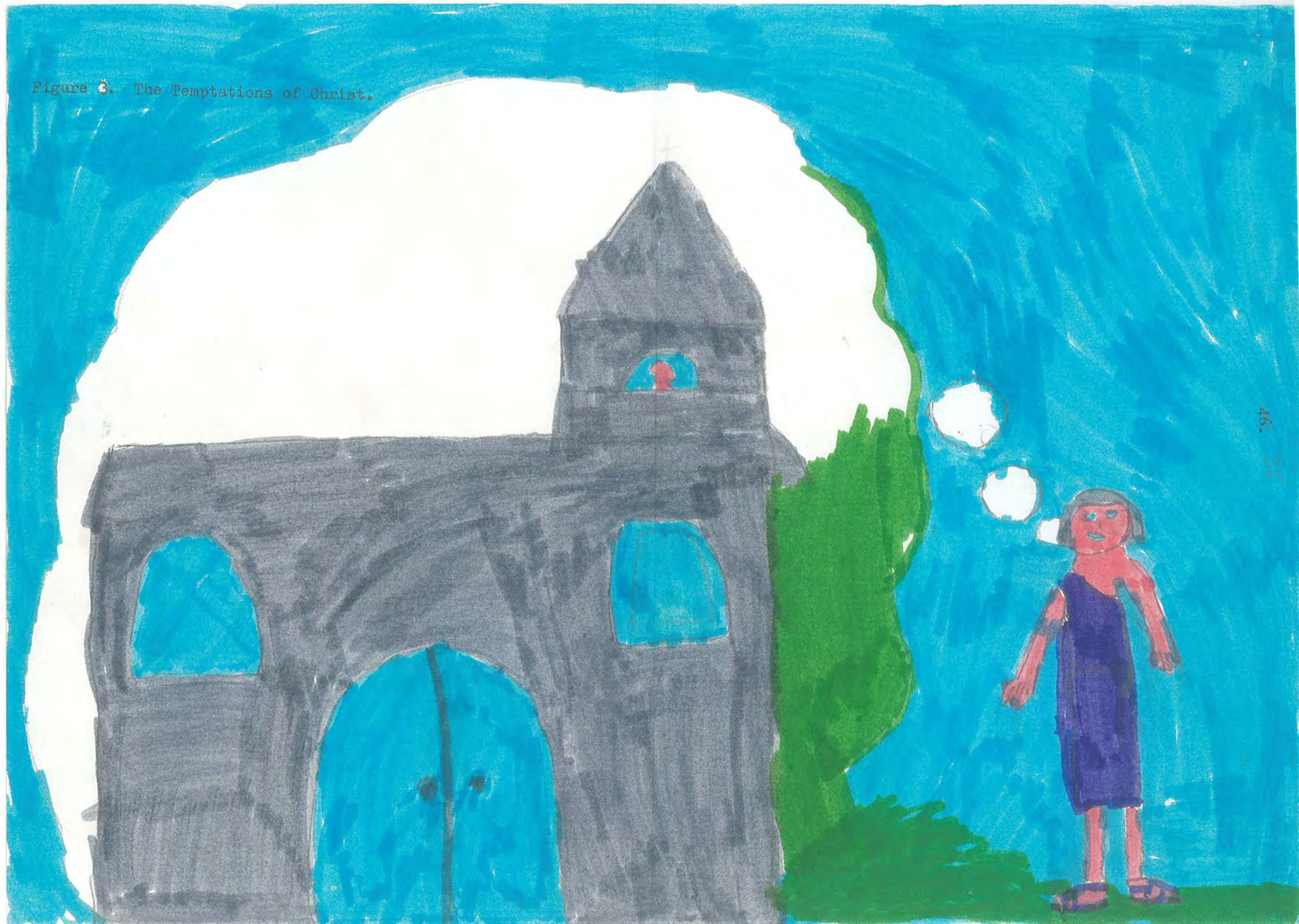
Figure 3: The Temptations of Christ.