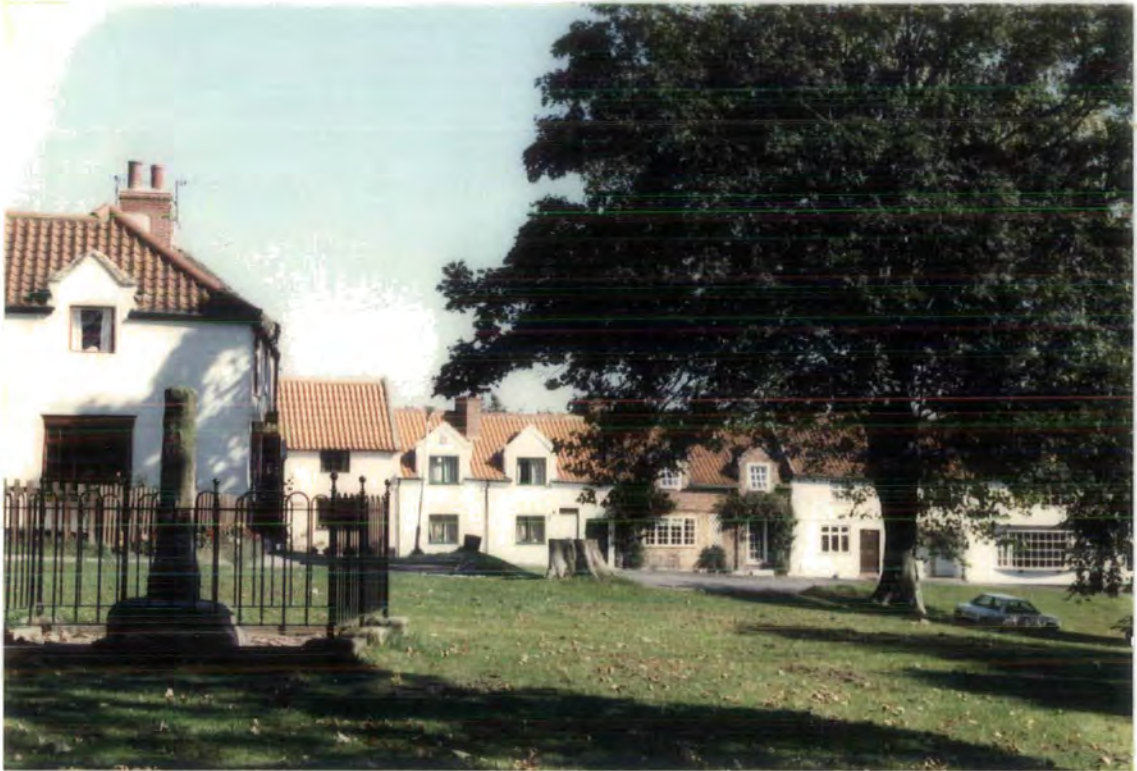
Plate II Eggescliffe C E Primary School