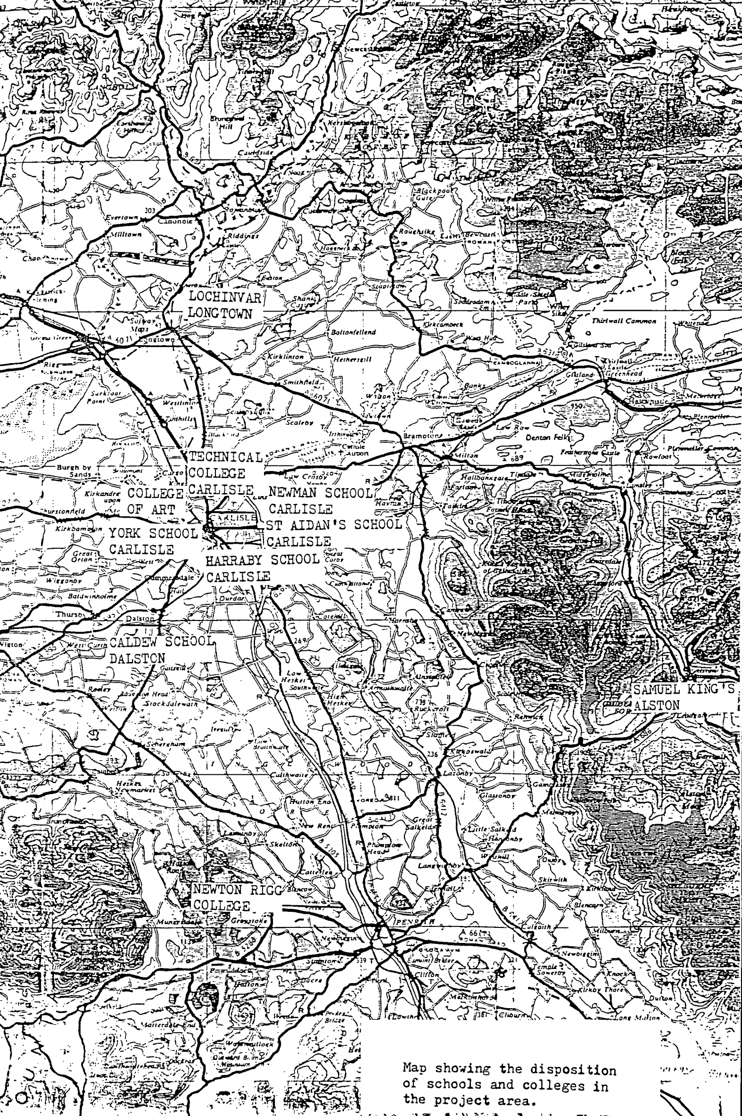
Map showing the disposition of schools and colleges in the project area.