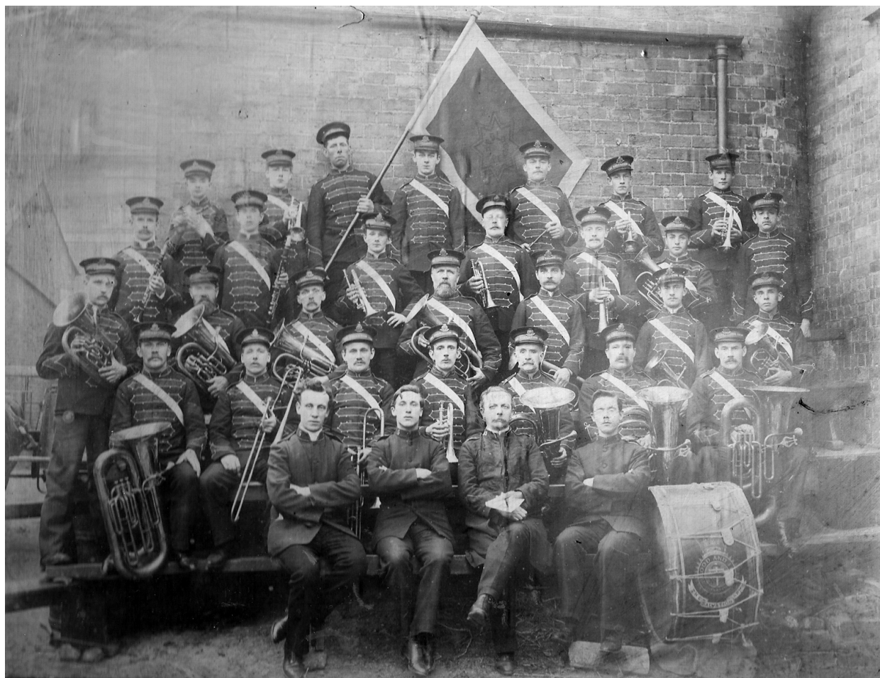
Figure 103: Hereford Salvation Army Band c1900 with two clarinets and a piccolo – top left

Salvation Army bands, like the one shown above, were free of contesting constraints and often included in their line-up woodwind instruments, or even a set of saxophones, well into the twentieth century. The regulations for wind band instrumentation in competitions has been, and still is, unspecified, and wind bands around the world perform with the instruments they have (or possibly bring in an extra player just for the event).