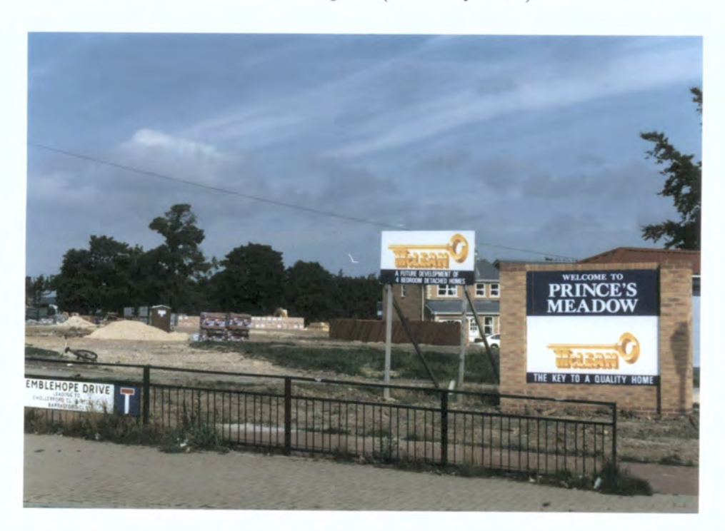
Prince's Meadow (July 1994)