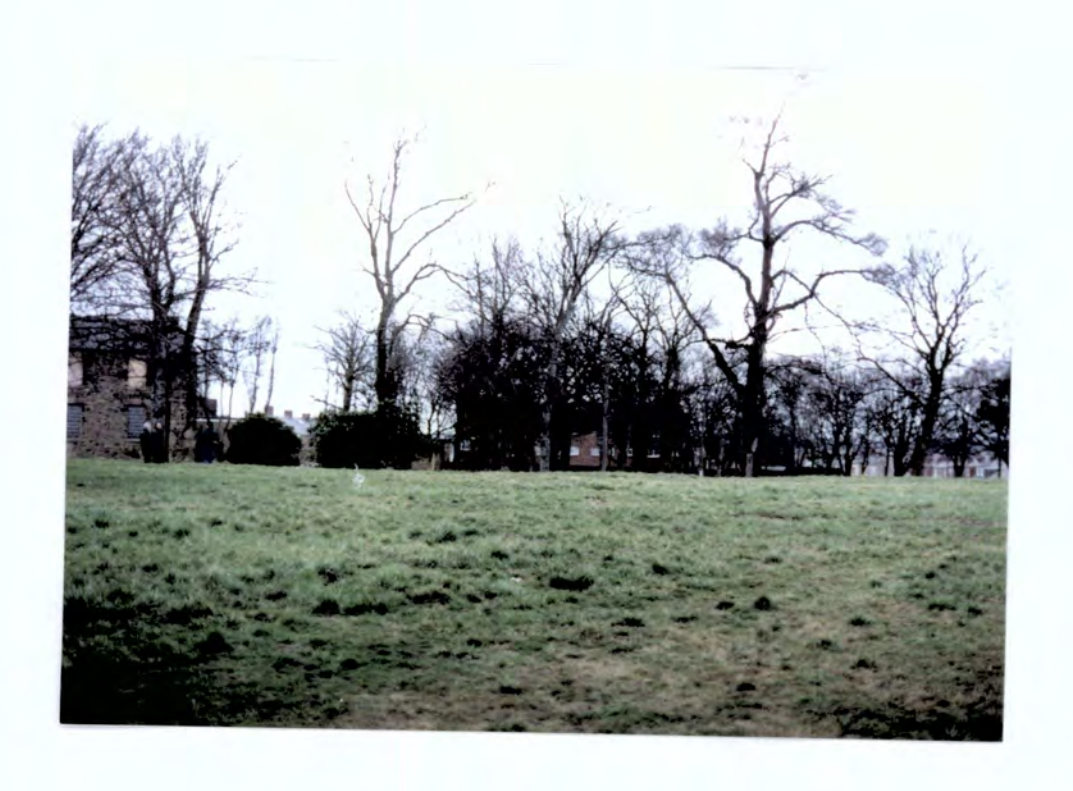
Facing north toward 'Dodd's Farm' (February 1994)