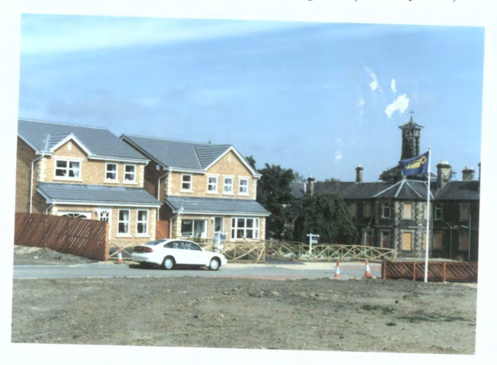
McLean's four bedroom detached homes (July 1994)