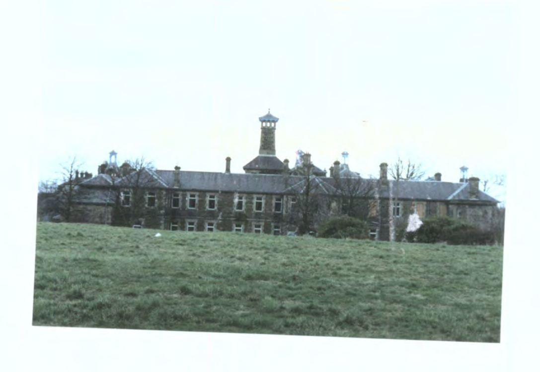
Hospital building and surrounding land (February 1994)