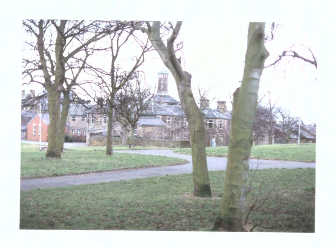
St Nicholas Hospital (February 1994)