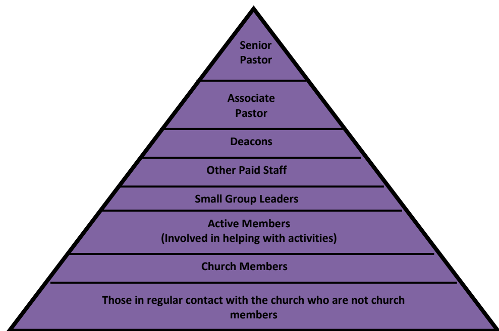
Figure 1– Structure of the City Centre Church

In the context of this study, the term 'leadership' operated at different levels. We first consider the city centre congregation.