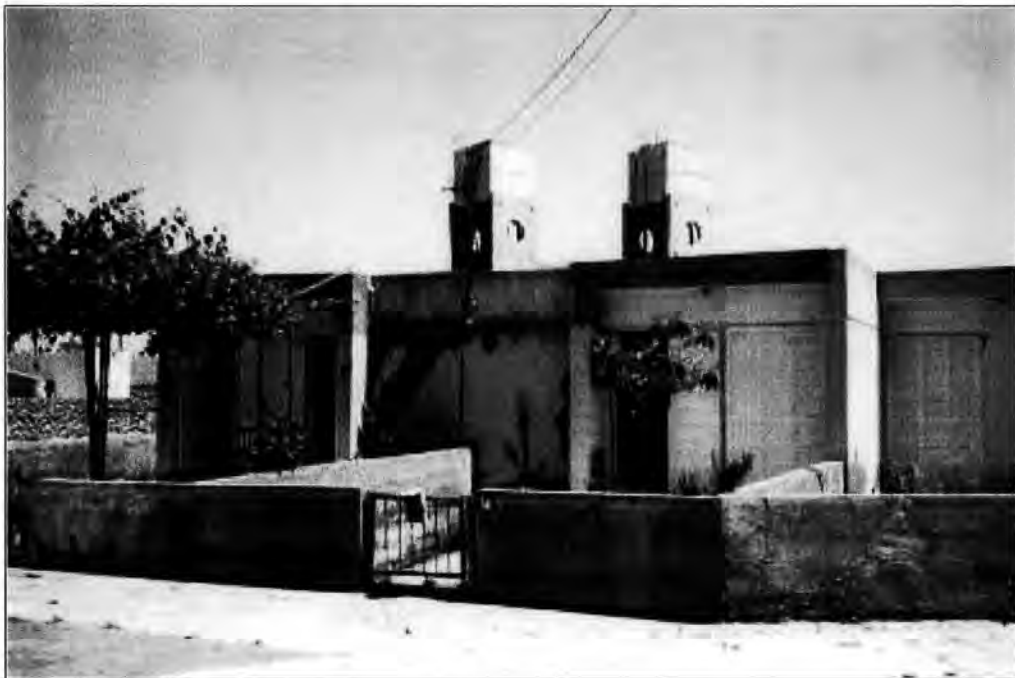
Houses were often constructed rapidly, to poor standards. Maintenance problems and ambivalent feelings toward houses can leave them looking very poor.