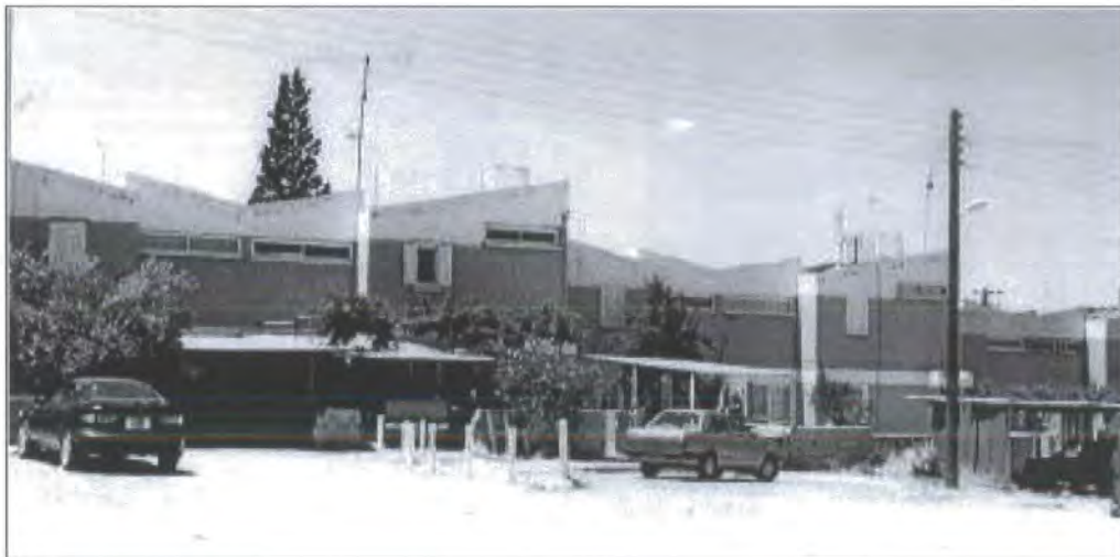
Car ownership in Strovolos 4. Car ports have been erected outside almost every home.

The estate was not at its prettiest in the February rain. The walls of the houses were a mixture of rough grey concrete and peeling whitewash paint. Their monotony broken by the wide organic sweep of the roads and the individual attempts of the residents to brighten their houses with fruit trees, hanging gardens and flowers. Their appearance was by no means one of affluence, but neither was it one of poverty either. The refugees have not been excluded from Cyprus' economic miracle. Indeed, it has been observed that it would have been impossible without their labour. Estate refugees have not shared in the rewards of the economic miracle to the same extent as other Cypriots and there was a clear appearance of poverty among the people of Strovolos 4. High levels of car ownership hint at what little wealth there is on the estate. The corrugated iron sheds and carports that house them in the absence of proper garages, have been erected outside almost every house and stand as testament to their importance among the refugees.