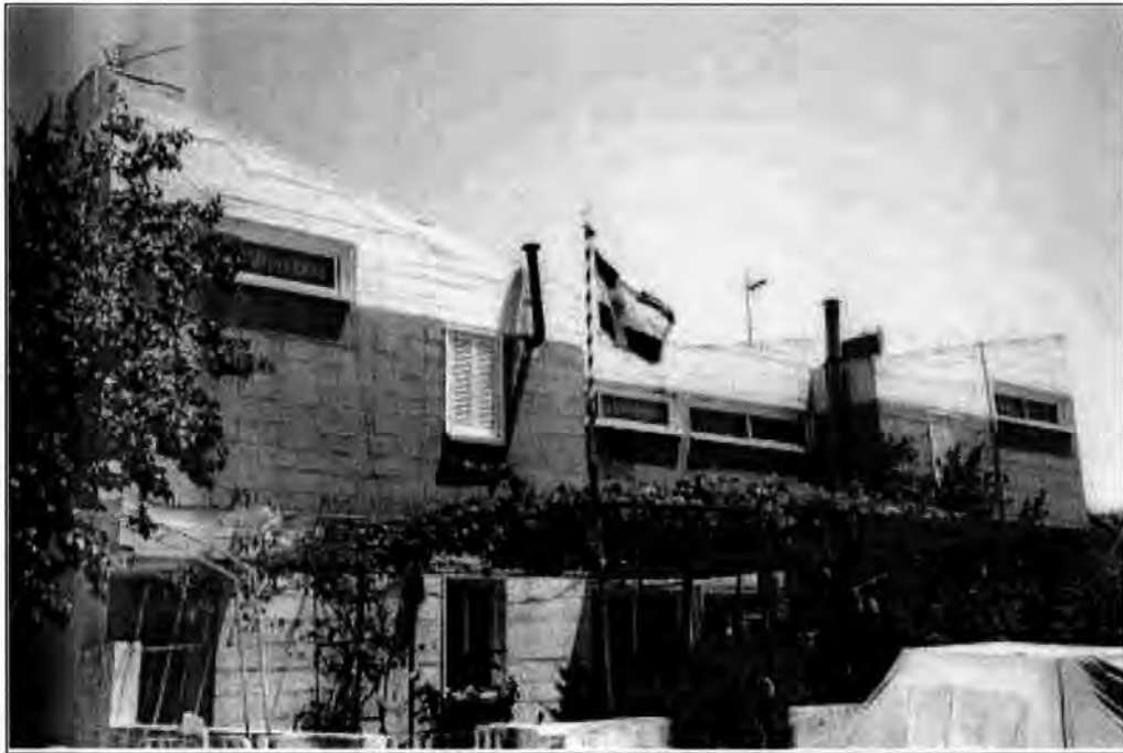
A flag emphasising Cyprus' Hellenistic identity flies outside this estate home. Identity is partly constructed along lines of nationalism. The partition of Cyprus is a part of the wider struggle between Greek and Turk.

The key to this dilemma lies in the language that young refugees use to describe their aspirations for return. The same commitment to return is vocalised by second-generation refugees as by their older relatives and in many cases it is spoken of even more vigorously. But the language used by younger refugees, appears in many cases to be bound into a framework of nationalism and antagonism toward their Turkish neighbours that is not often vocalised by their parents. The implication is that attitudes toward return are mediated and shaped through the context of the formal education that young refugees receive and through the constant ideological portrayal of the struggle from political and media sources. These attitudes are bound into a larger Cypriot identity that portrays Cyprus as the victim, whilst emphasising Turkish aggression and barbarity.