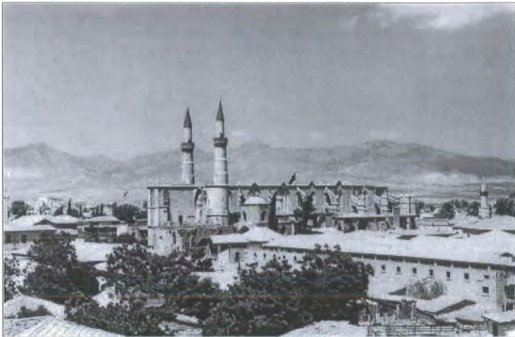
The view north. This view of a mosque in north Nicosia was taken from a building adjacent to the 'Green Line.' The mosque symbolises the history of Greek and Turkish ethnicity on the island. It was once a Christian cathedral, but was converted by the Ottoman Turks after their invasion in 1570. The mountains in the background are the Kyrenia range. On the central-left edge of the picture, a giant Turkish flag that has been cut in to the rock of the mountain and is clearly visible in the south, can be faintly seen as a pale area. It's existence is a symbol of Turkish control over the north and is greatly resented in the south.

justified its invasion on the basis of the Treaty of Guarantee, which had formed part of Cyprus' post-independence constitution. This enabled Greece, Turkey or Britain to intervene if the constitution was threatened as it had been by the Greece-inspired coup. Legal justifications apart, the invasion was ruthless, indiscriminate and led to the deaths of many thousands of innocent Cypriots. Although the major powers did not intervene to prevent the Turkish occupation in 1974, they have at least refused the Turkish held north the legal status it needs to break away from the Republic. In doing so, they have ensured that there is still hope of re-unification, however slim that prospect is becoming with the progress of time.