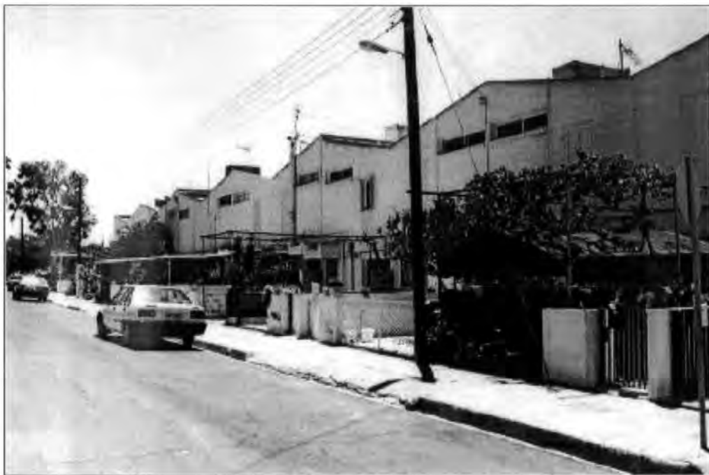
Refugee houses are a symbol of refugees' reliance on the state. Some estates, such as Strovolos 4, are particularly bad at conveying an image of institutionalised dependency on the state and difference from other Cypriots. Strovolos 4 was one of the earliest housing estates to be built and has a disproportionate number of low income refugees.

Those with surviving sources of income, property and with smaller families, were initially excluded by the access criteria. This had the effect of creating a class of refugees who were differentiated from fellow refugees and other non-Cypriots by their socio-economic characteristics. Being poor may have initially been attractive for low-income refugees in that it ensured access to housing, but as wealthier refugees were later incorporated by a loosening of the access criteria and were provided with higher quality housing than that rushed through for the poorest refugees, it came to be counter-productive. A social stratification became evident on the housing estates that reinforced and symbolised the image of estate refugees as low-income groups. "They are inhabited by a population of uniform demographic and socio-economic characteristics (larger families and poorer means). This image is underpinned by physical characteristics as well, since the oldest estates are, generally, much larger, housing designs are more monotonous, maintenance problems with the then new technology are greater." (Zetter 1991:48)