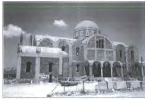
The original church (left) is being replaced by a more permanent structure (right)