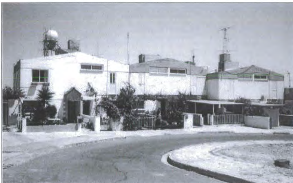
The house on the left of this picture, has recently undergone investment after the owner received title for his property. New windows, an extension (on the far left) and a new roof-mounted heating system have all been added. Other houses retain the appearance they had when they were first constructed.

has provided refugees with a potent strategy for keeping alive the issue of their displacement and their demands to have their original homes restored to them.