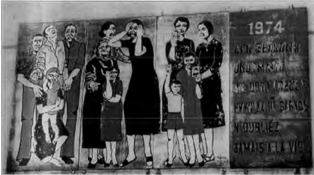
“We don’t forget” is the message of this painting. It hangs in a prominent public place in Strovolos 4 as a reminder of the refugee’s anger and grief. The central panel depicts grief; the one on the right depicts the issue of the missing. Cypriot women carrying portraits of their dead and missing sons or husbands are a common sight at the UN checkpoint in Nicosia where they gather to remind tourists using the checkpoint to cross to the north of the continuation of their plight.