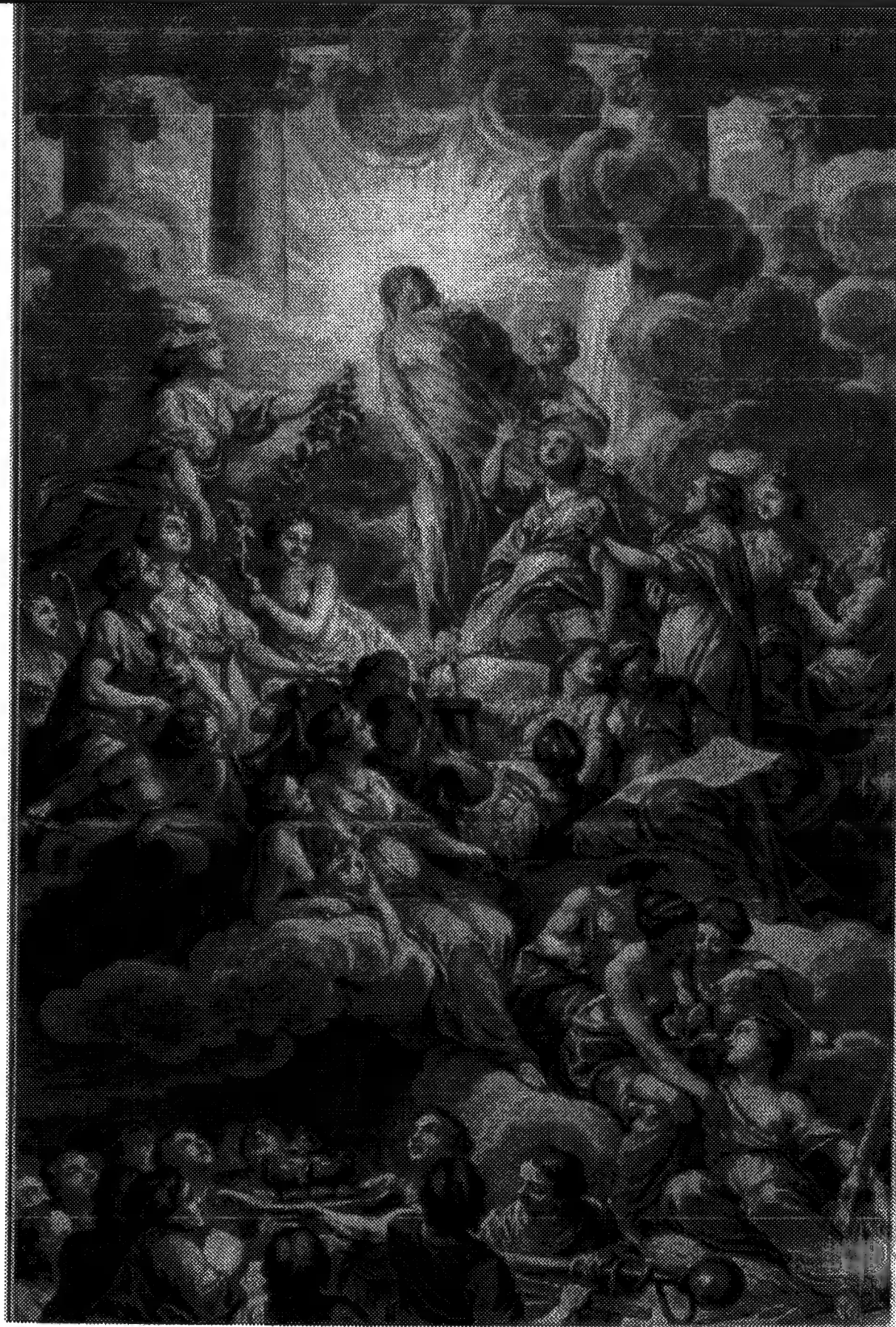
Frontispiece: Engraving by Benoît-Louis Prévost, Frontispiece to the 1772 edition of Diderot and D'Alembert's Encyclopédie (Fine Arts Museums of San Francisco). The engraving shows Truth, wrapped in a veil, encircled by Reason, Philosophy, Theology, and other personifications of sciences, arts and crafts.