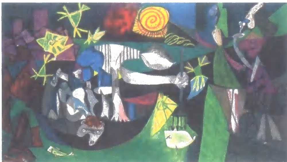
Fig. 1. Pablo Picasso, Night Fishing at Antibes .

triggers Wyatt's reverie is Picasso's oil painting from August 1939, Night Fishing at Antibes (fig. 1).