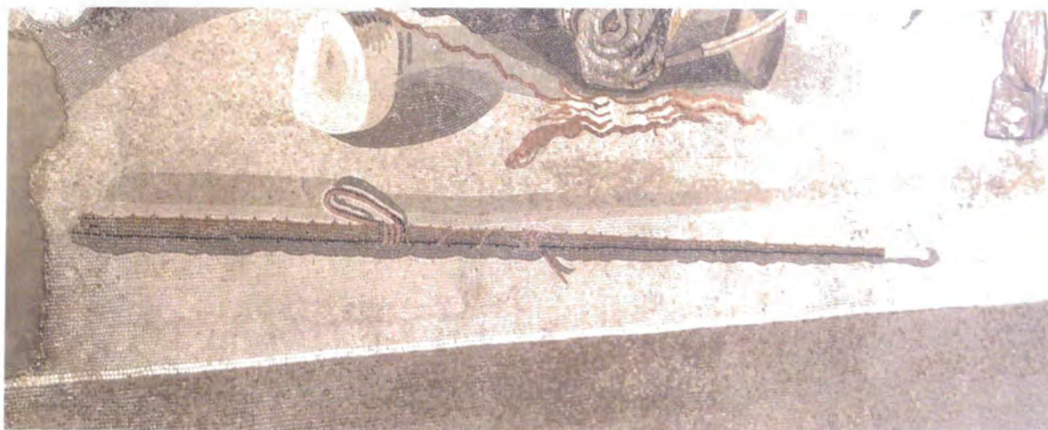
Plate 5 Cavalry sarissa.