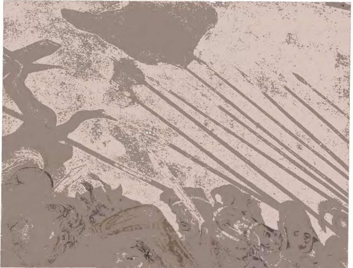
Plate 4 Detail of infantry sarissa.