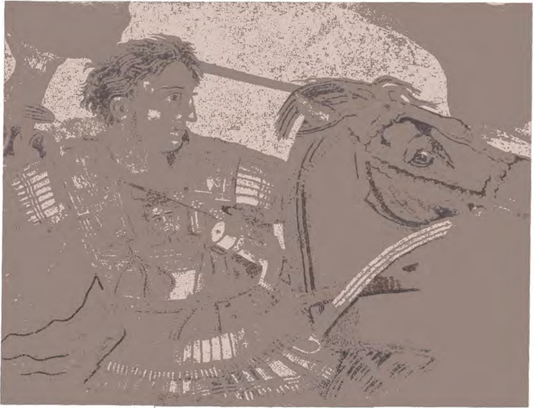
Plate 3 Alexander's armour.