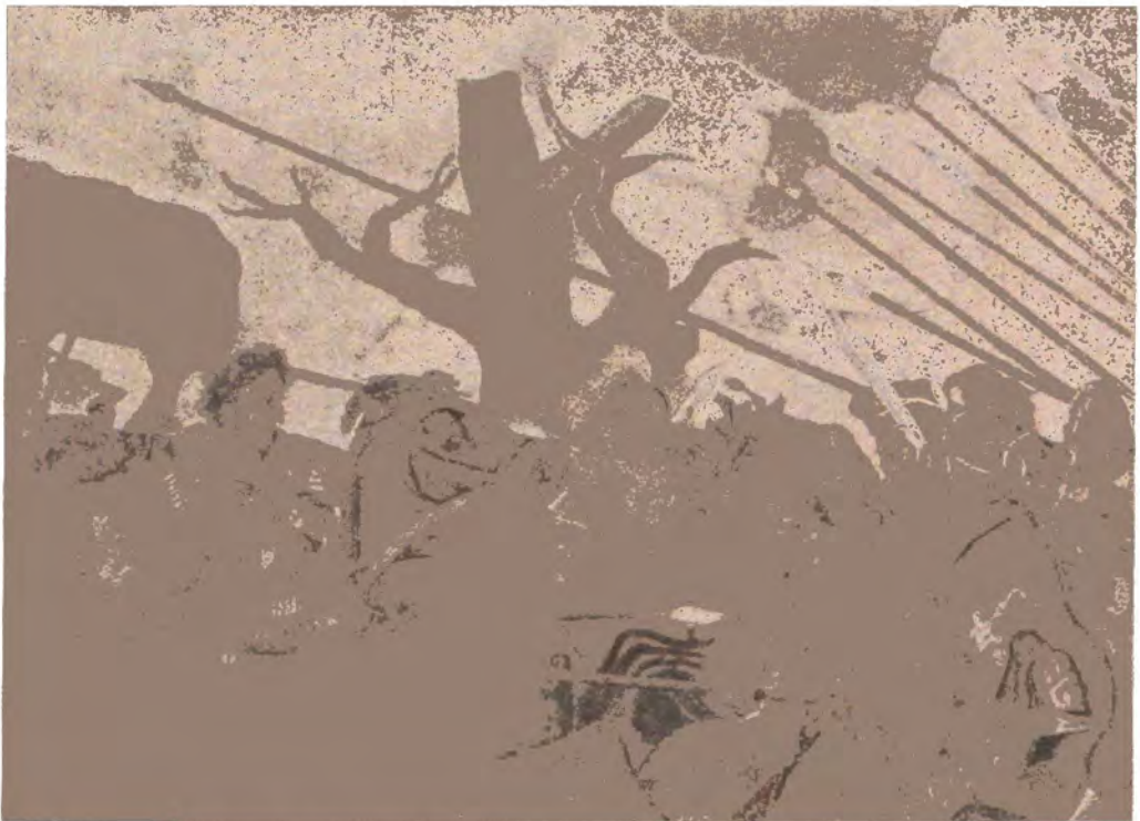
Plate 2 Alexander wielding an infantry sarissa.