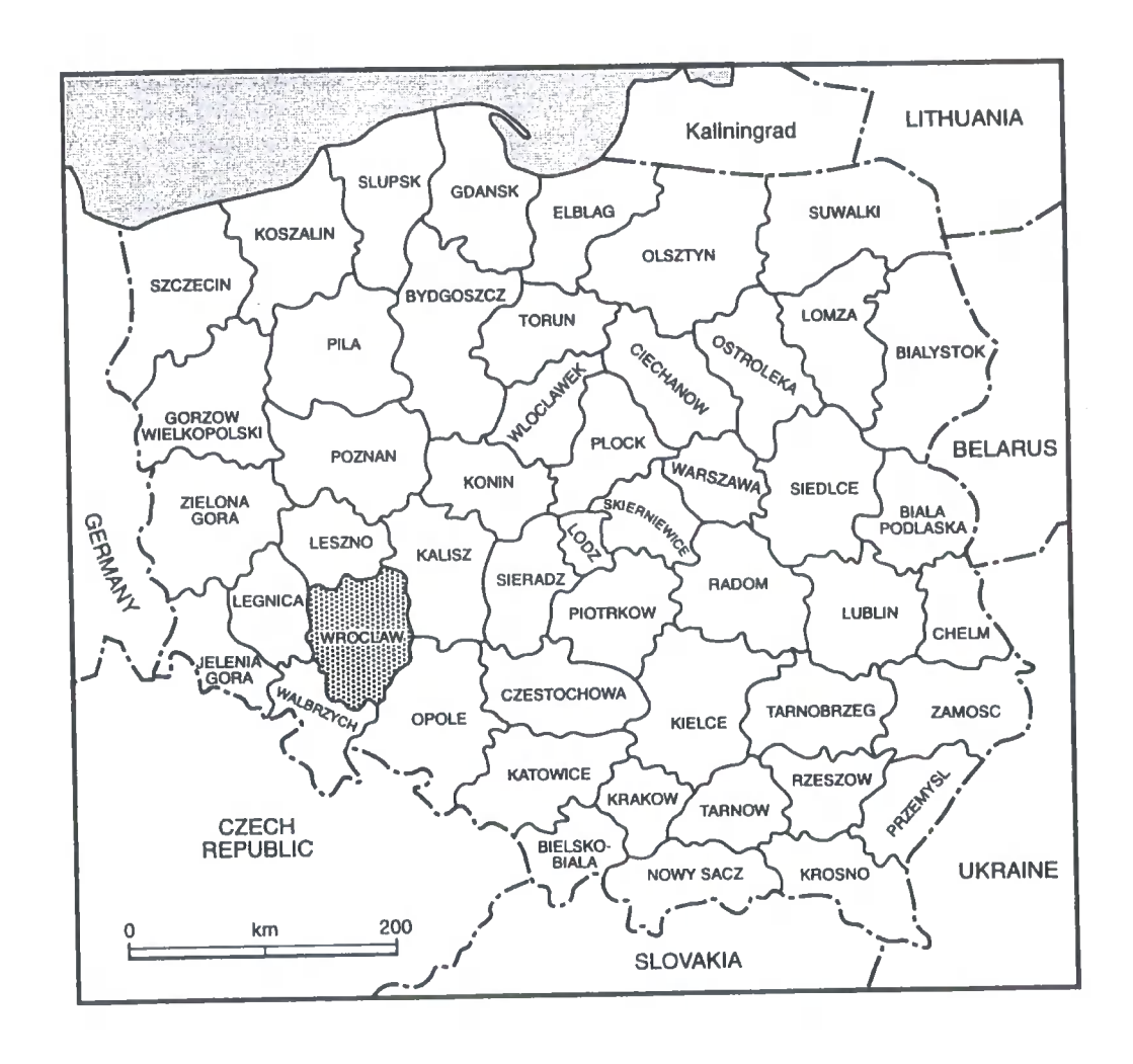
Figure 1.1 Map of Polish voivodship from 1975 to December 1998