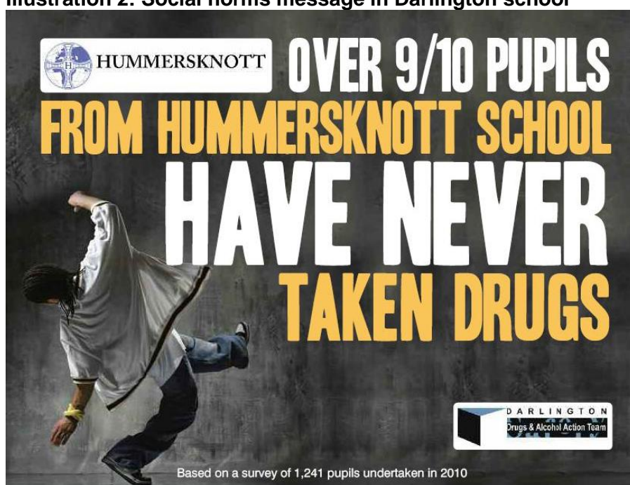
Illustration 2: Social norms message in Darlington school