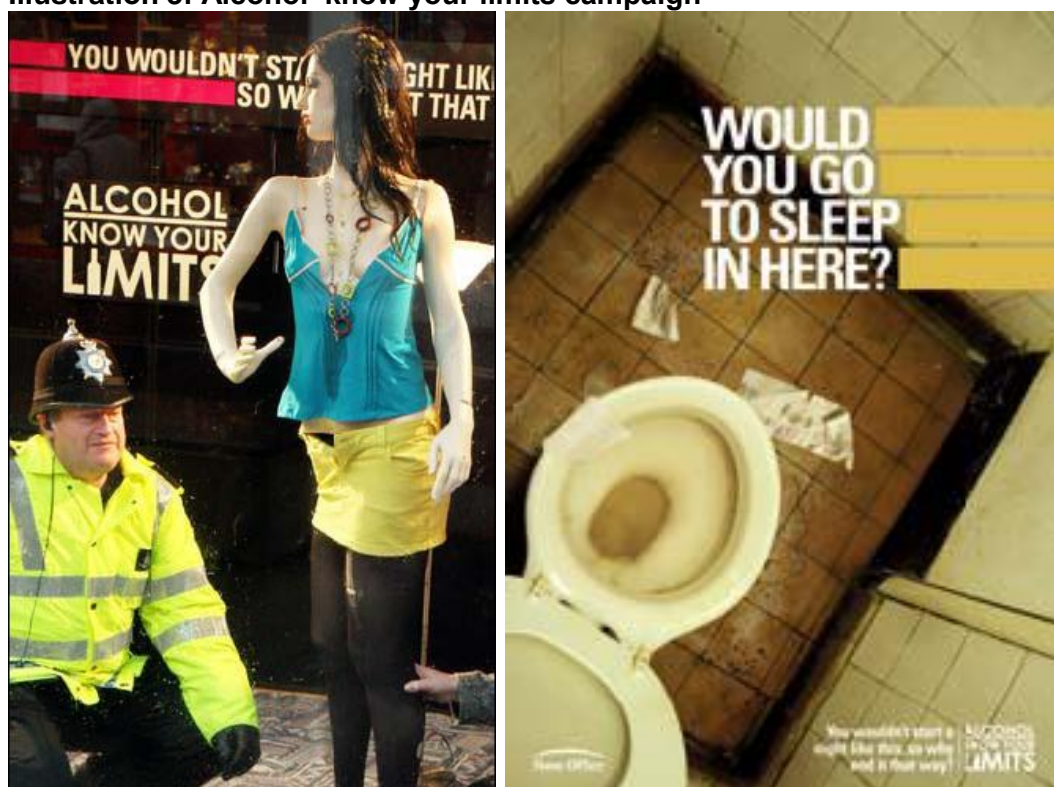
Illustration 3: Alcohol 'know your limits campaign'

Despite the government efforts to raise awareness of the harmful effects of alcohol misuse, when asked about safe drinking limits 10 out of 25 five respondents did not know what this was. This does not necessarily mean that information was not accessible, as this research discussed in chapter seven exposure, to information does not necessarily lead to learning and learning does not necessarily lead to modification of behaviour.