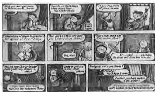
Fig 3. Jim Bloggs protects to survive.