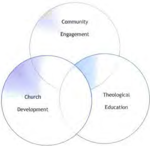
Figure 1: The Urban Ministry and Theology Project Model

rather than involving the expectation that this engagement would change the church itself. For UMT, engaging the churches with other local people created learning opportunities for the congregations as well as opening up pastoral and prayer opportunities, with one member of staff referring to their role as being “to expose them to these experiences, no matter how painful they are, so that they can learn and grow ... but not leave them high and dry” in the process. (In practice, these definitions warranted further attention, as I will shortly discuss).