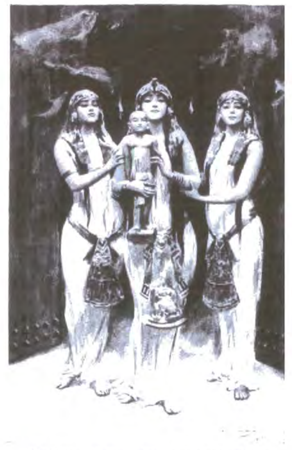
"The doors of the sanctuary between them issued—the goddess I (ite page 264).