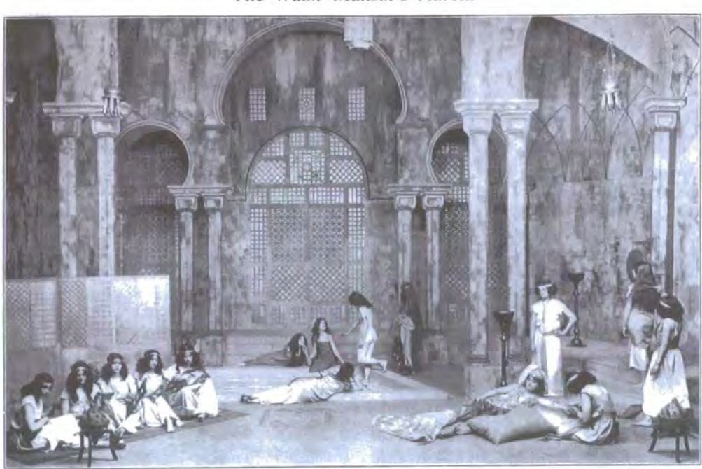
The Wazir Mansur's Harem

This moment of "nakedness" is depicted photographically in The Playgoer and Society Illustrated <sup>76</sup> which shows the tableau of a group of musicians with lyres placed at the foot of the stage as musical servants playing to the recumbent harem inhabitants opposite them on the stage. However the focus of the stage harem is not the foreground action, but the bath that is centrally placed beneath the painted arches, domes and latticed windows (signifiers of the space as 'harem').