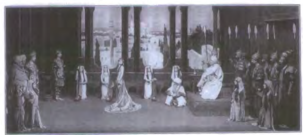
The Alman [adancer] (Miss NANCY DENVERS) dances before the Caliph.

Moving further into the twentieth century, Asche's stage spectacles progressively reveal more 'Oriental' flesh, as is apparent in their promotional photographs in publications like The Playgoer and Society Illustrated . Their spread on Kismet (1911) includes a number of images of veiled 'Oriental' female musicians<sup>72</sup> reflecting the seated or recumbent poses so popular in latenineteenth century "fine art" paintings of 'Oriental' women.<sup>73</sup> There are photographs of the Caliph receiving 'gifts of fair women from Egypt', one of whom is the scantily clad Miss Nancy Denvers as The Almah who dances for the king,<sup>74</sup> again a fantasy of 'Oriental' female flesh played out on stage. Not only did this 'Oriental' staging give women (and men) the chance to play at "going native", it gave (women and) men the opportunity of seeing semi-clad British women on the stage, made acceptable through their guise as the Other.