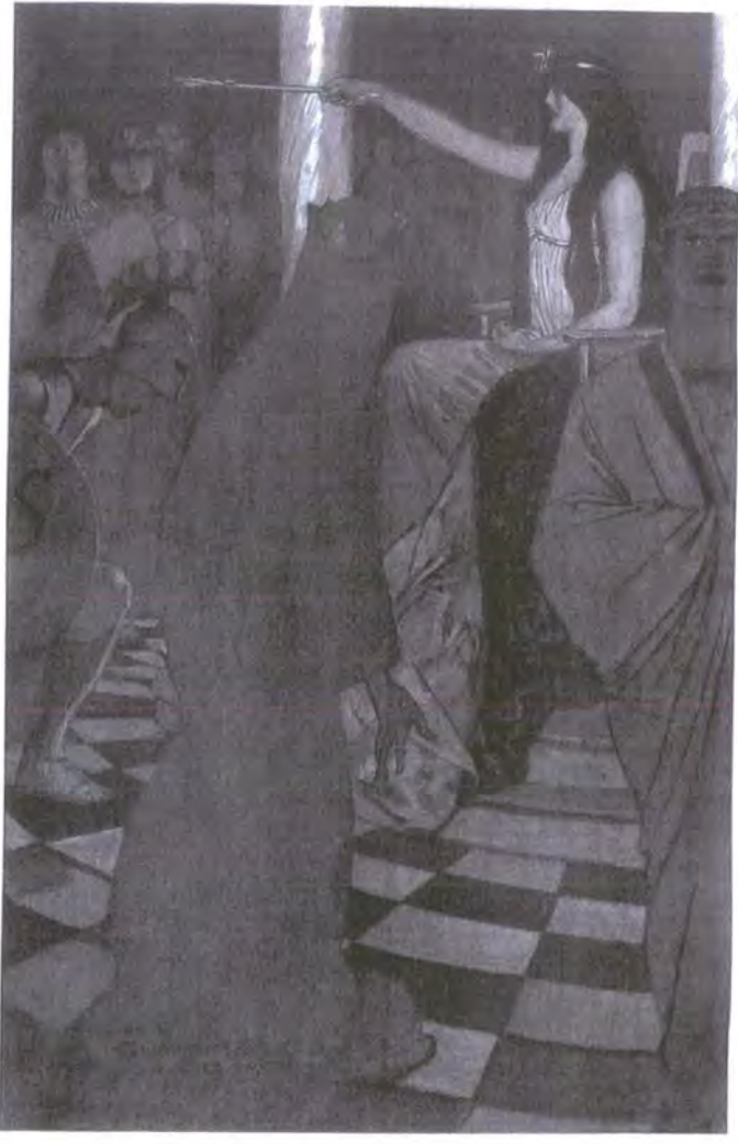
h A shadowy Shape arose before the throne and heat the knee to her.

lines that copy those of the throne and the pillars of fire, so he is again aligning her with the aberrant fire and also with royalty and power. In associating the two, the artist intimates that the fire is connected to her power, an association that Haggard also makes in the text: 'she was awful in her death-like majesty. The blue light of the sunken columns played upon her, and in it she sat erect, with such a face and mien of pride as no human creature ever wore.' The fire is giving an abnormal blue light just as Ayesha herself is not normal. In fact here Haggard emphasises that she seems to be not even human, something that her association with and worship by spirits supports, as at this moment 'She seemed a Queen of Death receiving homage from the dead.'