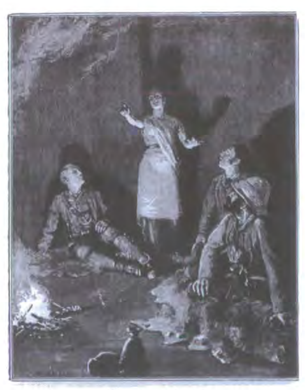
Theu art my chosen

As designated by Haggard Sorais is singing and playing a zither-like instrument, but this picture of a curled-over, downward-looking queen does not reflect the images of power and passion in Sorais' words.<sup>53</sup> In contrast to the regal and strong feminine women created by other Haggard illustrators Kerr's image seems somewhat superficial, related only to the action and not to the inner workings of this romance. Owing to the changes made by Kerr, and the disregard for Haggard's detailed descriptions of the women, the central physical (representing moral) contrast between the sisters is missing. Kerr ignores the orientalising of Haggard's descriptions of Sorais, instead classicalising her, and thus undermining the strength of Haggard's orientalising musicality at this moment.