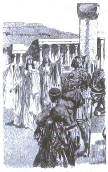
"Begow, mae ! cried a pricat " (see page 130)

Later in the text when in their earlier incarnations<sup>24</sup> the friends first meet as she is processing after singers to the temple 'shaking a sistrum that made a little tinkling music'.<sup>25</sup> She drops this sistrum, which is absent from Morrow's illustration of "Begone, man!' cried a priest", <sup>26</sup> thus her musicality is omitted when she is supposed to seem most pure as a virgin priestess.