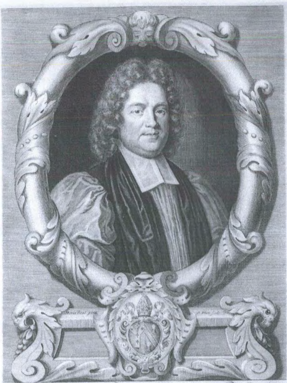
Figure 12- John Tillotson, Robert White. National Portrait Gallery. NPG D1341

Reverendissimus in Christo Pater IOHANNES TILLOTSON Providentia Divina Archiepiscopus CANTUARIENSIS totius Angliae Primas et Metropolitanus Serenissimis Principibus Regi GULIELMO et Reginae MARIAE a Secretariis Consilij. Printed for B. Aylmer & W. Rogers