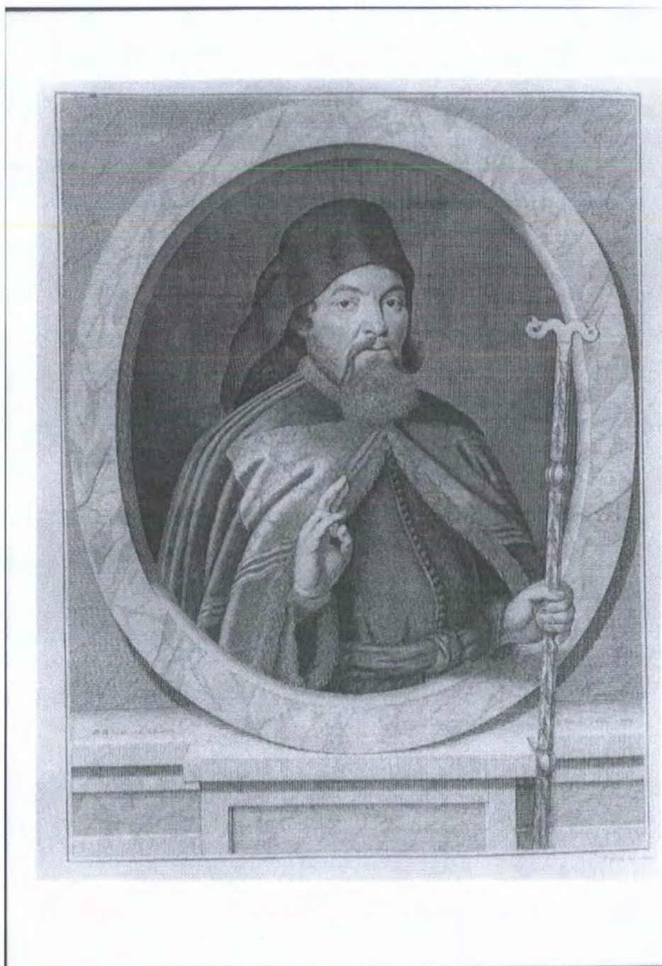
Figure 13 - Archbishop of Philopopoli, Robert White . Pepys Collection. 2980/132