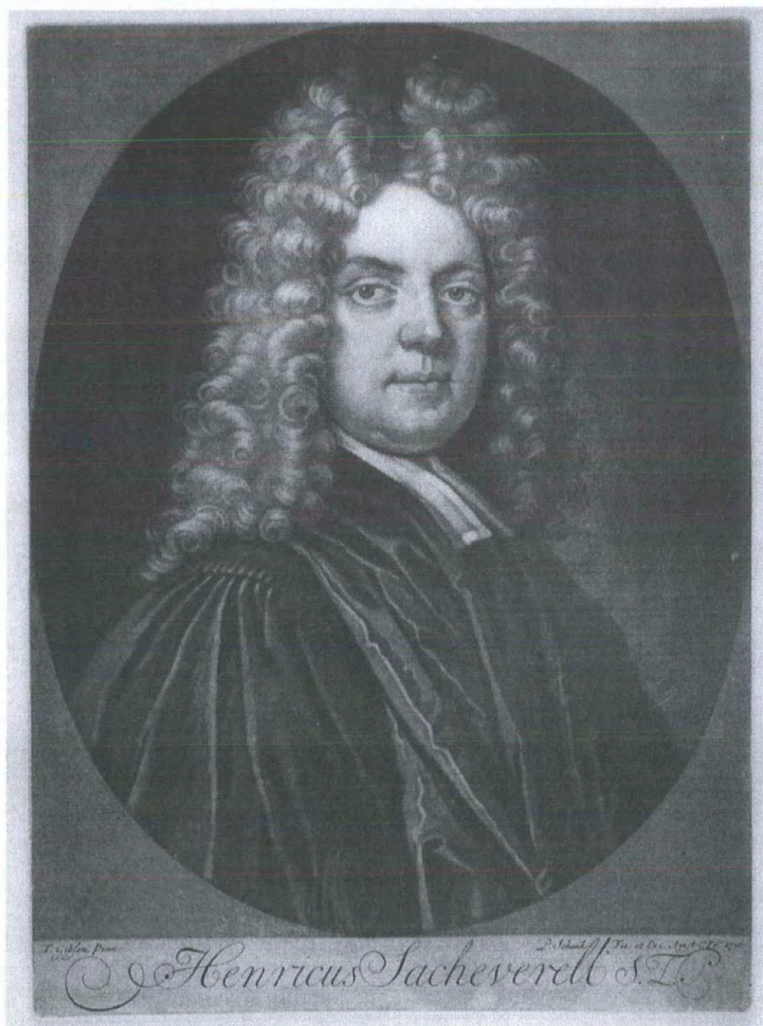
Figure 1- Henry Sacheverell , Peter Schenck. National Portrait Gallery. NPG D4126