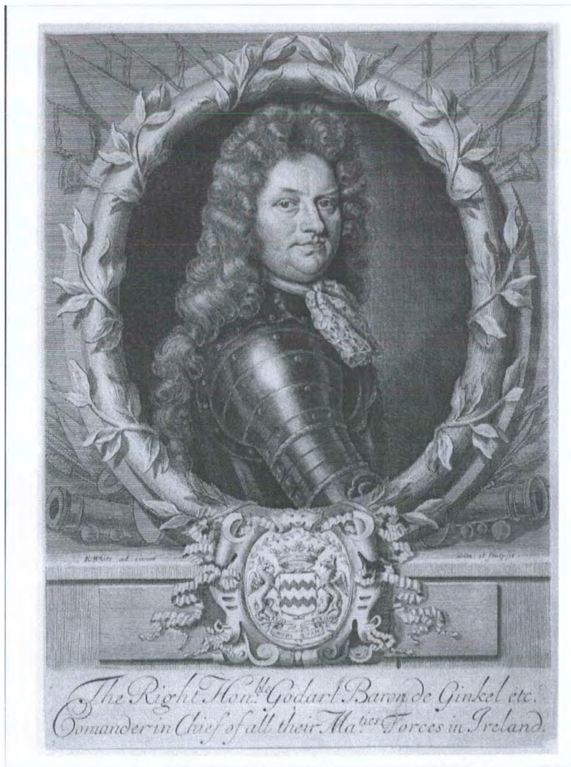
Figure 18- Godard van Ginkel , Robert White. National Portrait Gallery. NPG D7423