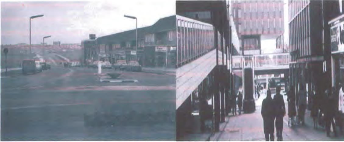
Fig. 17: Peterlee town centre taken from the same position in 1959 and 1976.

The corporation was also eager that Peterlee's enhanced role in the district should be augmented by the introduction of some form of entertainments centre. When the new town was designated in 1948 a directive was that it should act as a focal point for the surrounding district's population; an important way that this could be realised, it was felt, was the provision, at as early a time as possible, of an entertainments centre where the people of Easington district could congregate and amuse themselves. However, by the mid-1960s, no such centre had materialised. This had led many local commentators to conflate the lack of centralised entertainments provision with the apparent absence of social cohesion in the town. Without a central focus, it was claimed, it would always be difficult to create socially-balanced communities in the district.