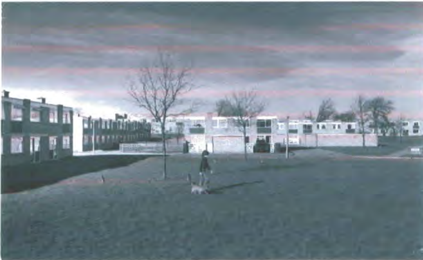
Fig. 22: Industrialised-built housing in Aycliffe

For Aycliffe Development Corporation, the introduction of the new system was particularly welcomed: it helped considerably to keep costs lower in its attempts to expand the town during the 1960s. 'The upward spiral of building costs and its reflection in the increased level of house rents has caused the corporation much concern', it wrote in its 1965 annual report 'it is hoped that the extensive use of the industrialised method of house building will help to stabilise building costs'. 27 The assumption was that the new system would lead to a steady increase in the number of houses built annually until a completion rate of 600 houses per year was achieved by 1969. 28