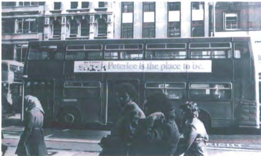
Fig. 21: Peterlee advertising on London bus, 1977.

Peterlee's industrial fortunes also took a turn for the better during the 1970s due, in no small part, to the corporation's more professional approach to employment generation. In 1977 it reported that more than 500 jobs had been attracted – a remarkable feat considering that unemployment was soaring in East Durham as a whole at the time. What was more impressive was that it occurred when textile and clothing manufacturers on the estate were making hundreds of workers redundant.