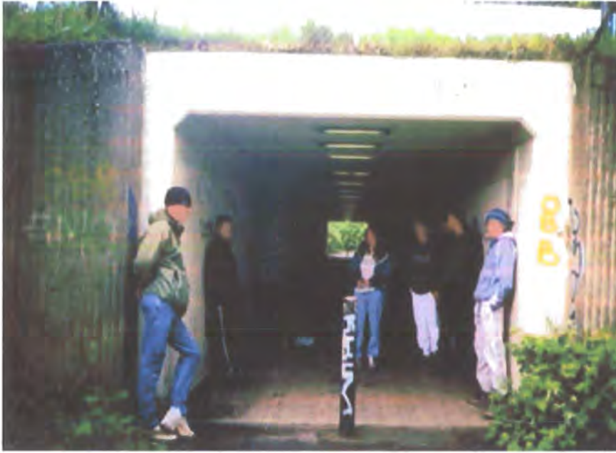
Fig. 23: Youths at Donwell subway

Some commentators have stressed that the problem was attributed to a lack of employment opportunities created for school leavers, which had left many young people with little to do but roam the streets and on many occasions get into trouble with the police. Another factor, however, was the distinct lack of facilities for young people, largely as a result of the miscalculations by the corporations over the number of youths there would be at any given time. 158 In 1966 a youth club was provided in Peterlee town centre at a cost of £45,000. Within weeks of its construction more than 500 young people had become members; 300 more were placed on a waiting list. In all 41 per cent of adolescents in the new town were members of youth organisations compared to a national average of 35 per cent. 159 Hopes were high that the proposed ten-pin bowling alley and cinema complex planned for 1966 would provide entertainment for the town's youth, but when negotiations for the complex collapsed in 1965, they were once again left with very few forms of entertainment. 160