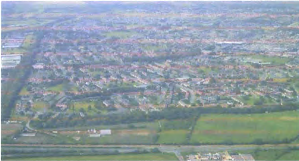
Fig. 24: Aycliffe at the time of dissolution.

In a way, whom the corporations hired as architects became academic: within a few years, their role as providers of housing was terminated anyway. Peterlee Development Corporation's last building project was completed in 1977. After that small infill schemes were the only remaining means of increasing the housing stock. 168 In April 1978 Peterlee and Aycliffe became two of the first new towns in the country to transfer the ownership and future supply of their housing stock to local authorities when they passed over their housing functions to Sedgefield and Easington district councils respectively. 169