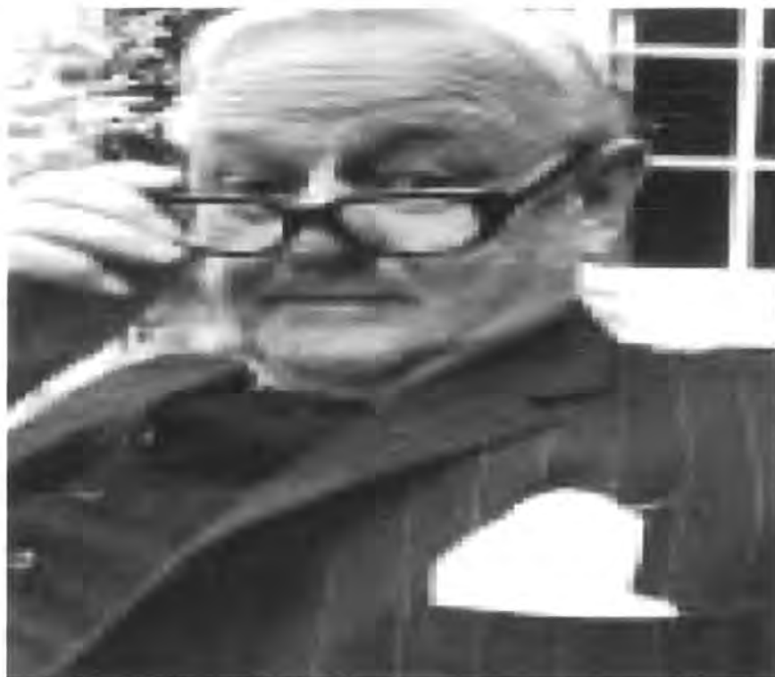
Fig. 14: Lord Hailsham

of the region's traditional industries; the salience of oil over coal as the major source of energy in the western world; the dearth of research and development establishments, and concomitant lack of research professionals; the inadequacy of the region's home-grown manufacturing industries – all had contributed to dissipation of the industrial revival achieved in the region in the ten years following the war.