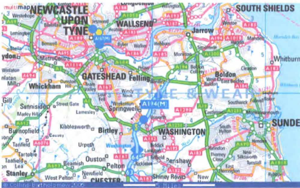
Fig. 15: Washington within Tyne and Wear

Despite these objections, Hailsham argued that development at Washington was essential to stimulate faster progress of the region’s industrial base, and in raising the scale and quality of its urban development generally. Also, because of its location relative to the Tyneside/Wearside urban complex, Washington, more than any other new town outside of London was firmly integrated into its regional role. 36 Strategically, the proposed designated area was situated in an ideal location: to the west it adjoined the Birtley by-pass on the A1 motorway; to the east it was within easy reach of the A19 and the Tyne Tunnel. 37 Moreover, the area had ample land for both residential and industrial purposes, an important consideration as such land free from the effects of subsidence was in short supply in that part of County Durham.