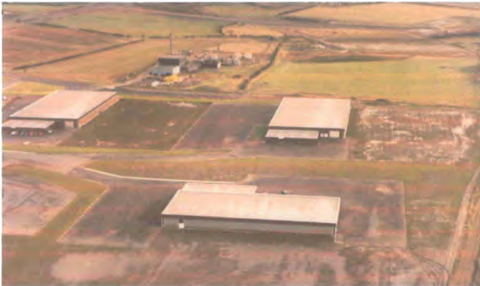
Fig. 20: Advance factories being erected to the west of the A19 at Peterlee.

The corporation was also encouraged by the success of its smaller workshop units after 1963. The units of approximately 1,000 and 2,000 square feet in size were found to be very popular with start-up businesses and firms which required temporary accommodation while bigger premises were being built. For Williams, they represented the backbone of British industry, and that Peterlee was merely a modern-day equivalent of what had made the country so prosperous during the late-19th century: