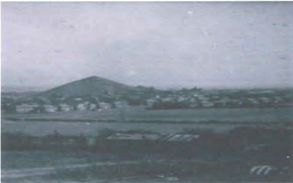
Fig. 16: Housing at Albany in the late 1950s with pit heap in the background.

Along with the planned transformation of the district's roads, Washington's housing, too, was about to undergo radical changes. At the time of designation, residential development consisted of little more than a series of settlements loosely strung together. 53 Also, a lack of adequate housing, both in quantity and quality in the district not only added to its general unattractiveness but was also perceived as a major reason for the absence of many professional and managerial workers in the sub-region. 54 In the northern part of the town, miners' cottages built during the late 19th century and associated with Usworth colliery were situated alongside local authority-owned estates built mainly during the inter-war years. Washington village was comprised, for the most part, of miners from Glebe colliery's houses, whilst the majority of houses in Columbia had been constructed more than 40 years prior to designation and were primarily for workers at Cook's iron foundry.