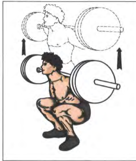
Figure 8. The free-bar squat 65

A bodybuilder must learn to attack the pain of muscle exhaustion and seek its agonising intensification. This requires learning to identify the sharper, more located pain of a muscle tear, learning to anticipate when to stop attacking that sensation and learning to sense when the tear has repaired sufficiently to allow training to resume.