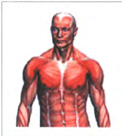
Figure 9. Mapping intensity through the body

Organic nutrients, hormones and steroids 67 are transported and assimilated, delivered by blood into muscular cells where they prompt the accretion of body tissue as muscles repair and grow in response to training. Muscular fibres exchange pressure, shifting and realigning to gain purchase on weighted resistance. Stress is transferred into them, opening up small tears in tissue that then becomes hungry for nutrients with which to repair itself. The weighted resistance crucial to promoting this stress is found in the equipment that fills the gym-floor. The many and varied apparatus that are available are carefully designed to exchange pressure from their moving parts, through their static frame and into the muscles of the user. For example, stanchions placed in the centre of the gym support a set of cross cables. They frame the transmission of resistance from the weight stacks at either end of the structure, down the steel cable and into the lower pectoral and front deltoid muscles with which they are brought into relation.