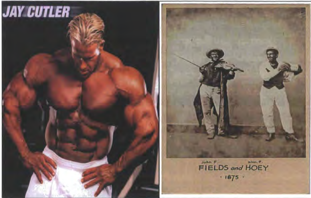
Figure10. Skin darkening techniques 74

The skin darkening techniques used and the skin tone sought by Burnley's Nineteenth Century minstrels, were very different to those of the competitors at Mr Calder Valley. Whilst practised in disparate cultural contexts, both minstrelsy and bodybuilding see flesh darkened and objectified for the excitement of a crowd. At the Mr Calder Valley competition, the significance of skin colour was marked by judges following an aesthetic scheme that specifically disregards colour as reflective of personal worth, beyond one's success at bodybuilding.