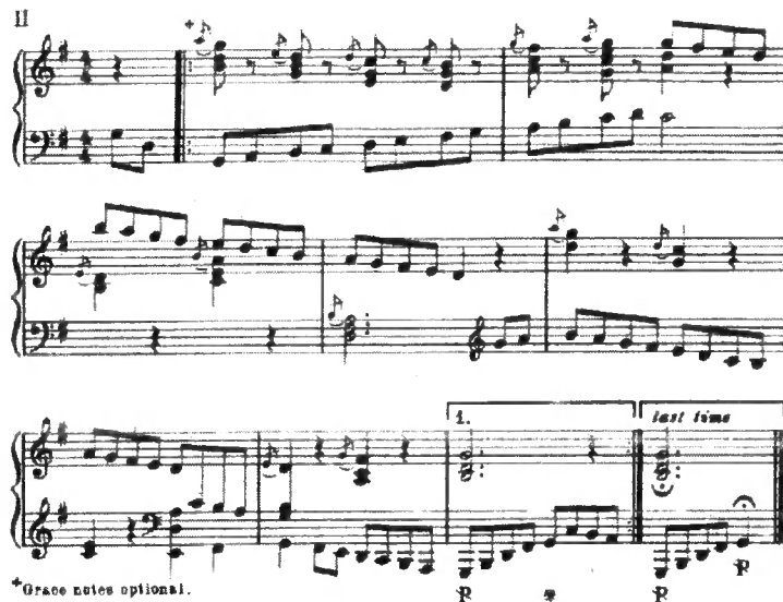
Ex 3: 'Derwentwater' from North Country Ballads, Songs & Pipe-Tunes . Second contrasting, independent accompaniment.

Besides those techniques of singing in choirs, there was an assiduousness for teaching 'new' music. The teaching of music by Dvořák and Wagner was juxtaposed with Bach and Purcell on the one hand and modern French music on the other and was heartily endorsed by a series of well-educated graduate teachers from backgrounds at Oxford and Cambridge. Similarly the increasing output of 'school songs' by significant British composers were promulgated as part of modern educational policy. All of this is evident from the speech-day programmes which have survived at Blandford House in Newcastle.