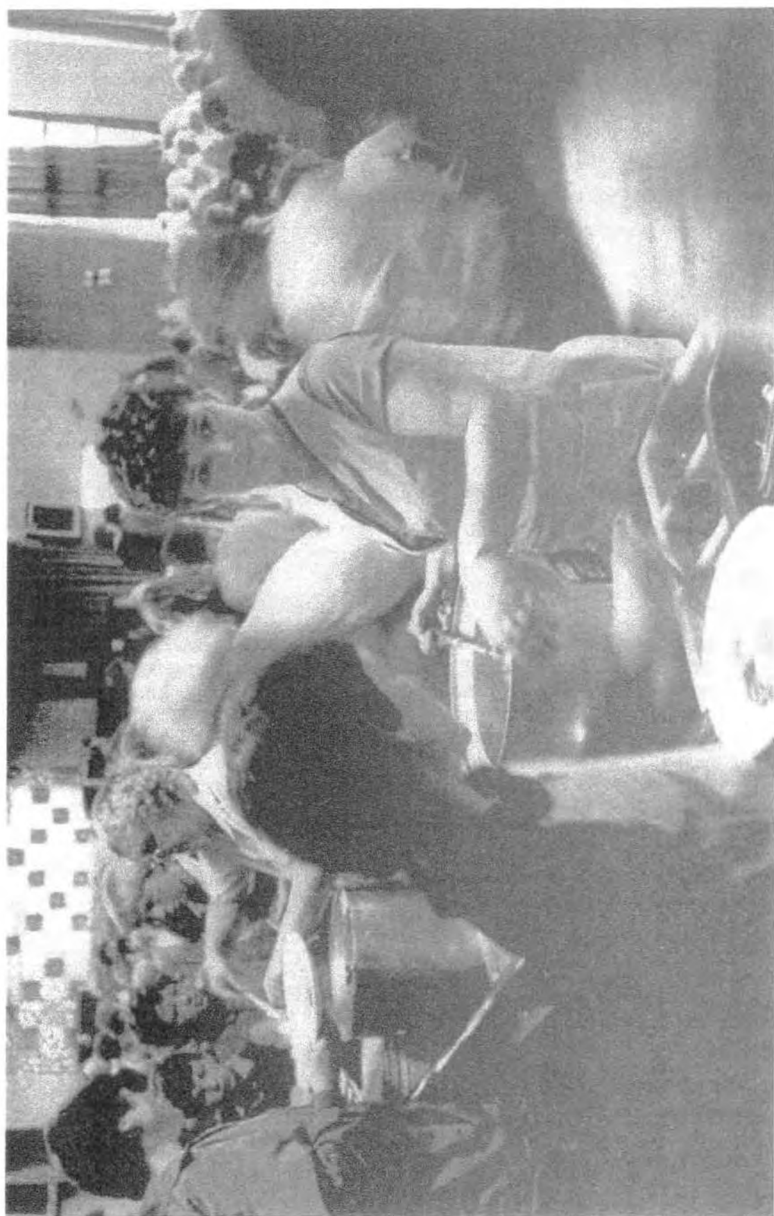
BOY WITH BAG, 1944