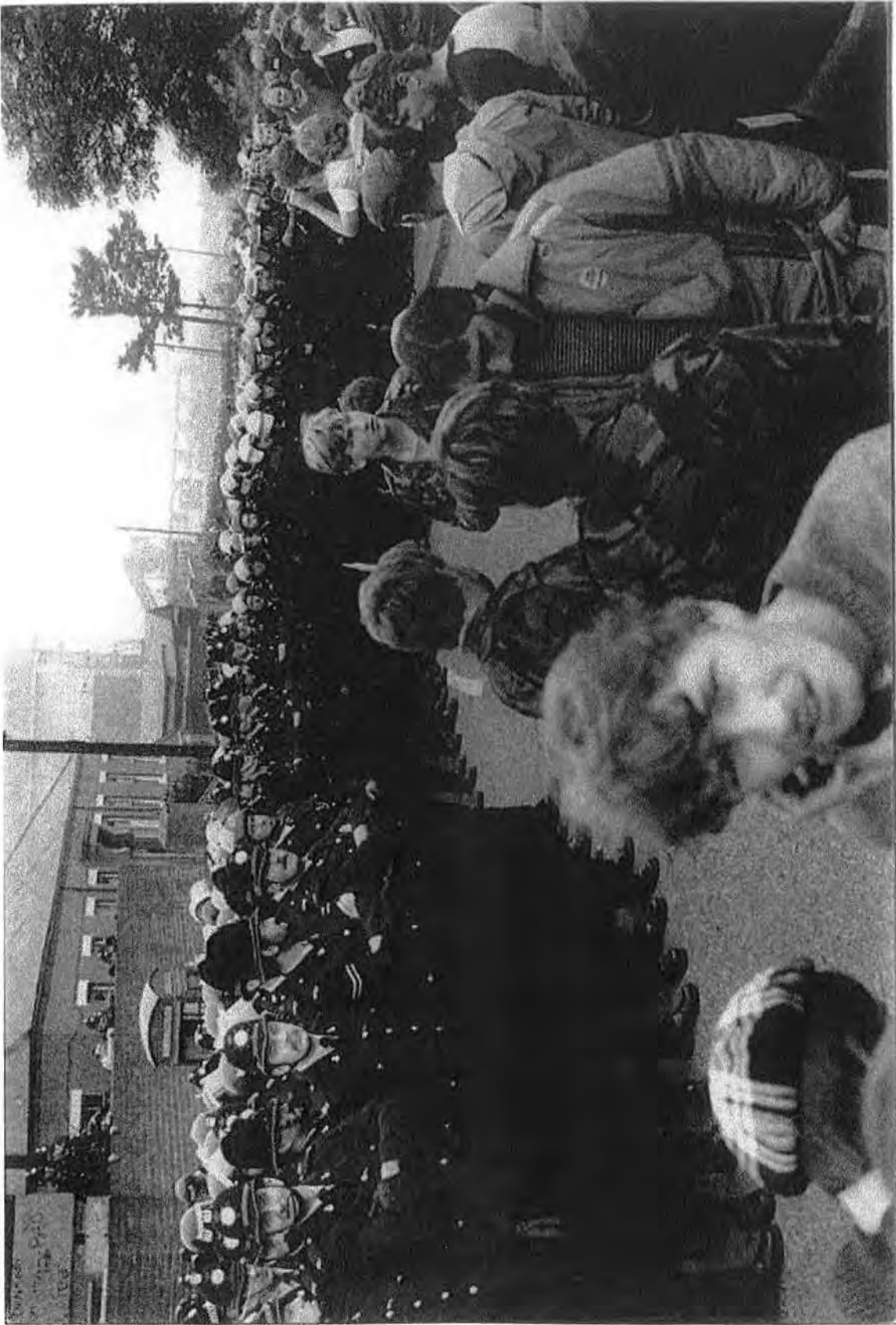
THEY ARE THE GUARDIAN ANGELS