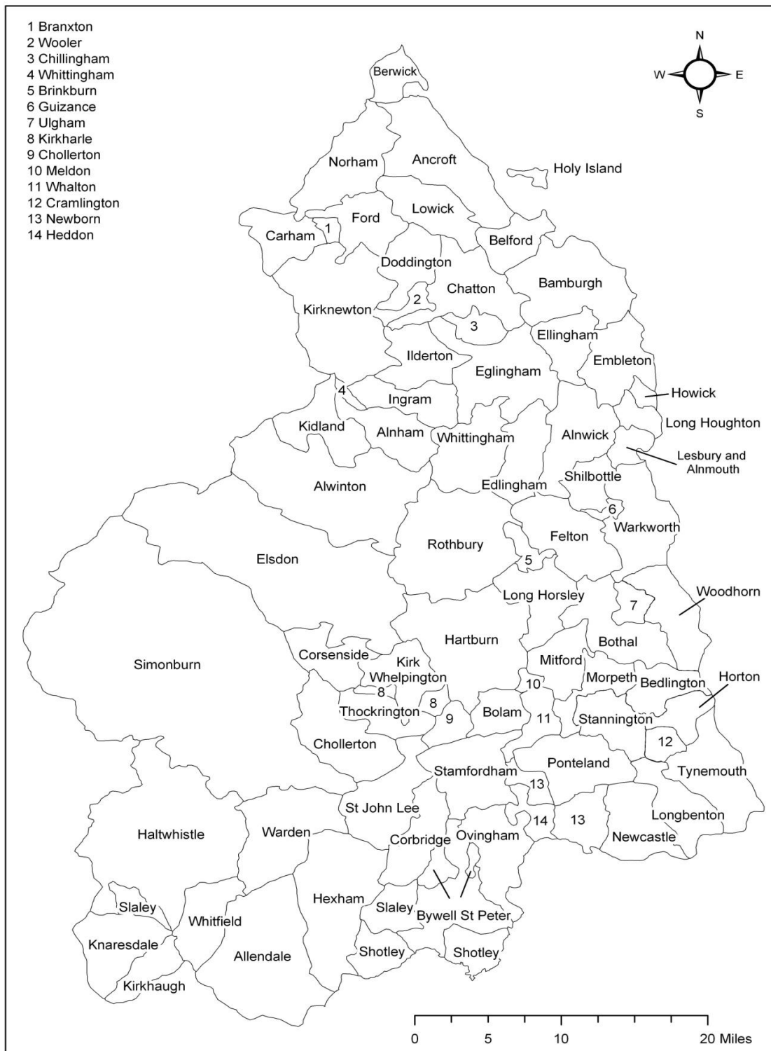
Map 3. Parishes of Elizabethan Northumberland 3