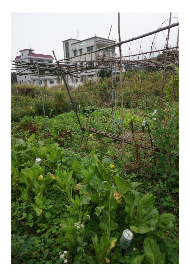
Figure 4. Village houses in the New Territories. To maintain anonymity and confidentiality, this is a photo I took during fieldwork but not for the specific house described here.

I refer to this group of people as 'members of the village house' because the house represents the lifestyle and those who created and live in it. It had been made not only a rented place but a field where its inhabitants built their ideal life. Members of the house personalised it by hand-crafting their daily necessities. Most furniture, decoration, appliances, and tableware were made, designed, or recycled by themselves. They are families, friends, and community members. Except for one or two days a week going back to their original homes to see their families, they live, cook, eat, and organise various events together. To become a member of the house, one must be accepted by other members and have fundamental skills for living independently from the market mechanism, such as farming, cooking, photography, drawing, pottery, or carpentry. Members are encouraged to develop their own talents and interests, but everyone must make a substantial contribution to maintain the house.