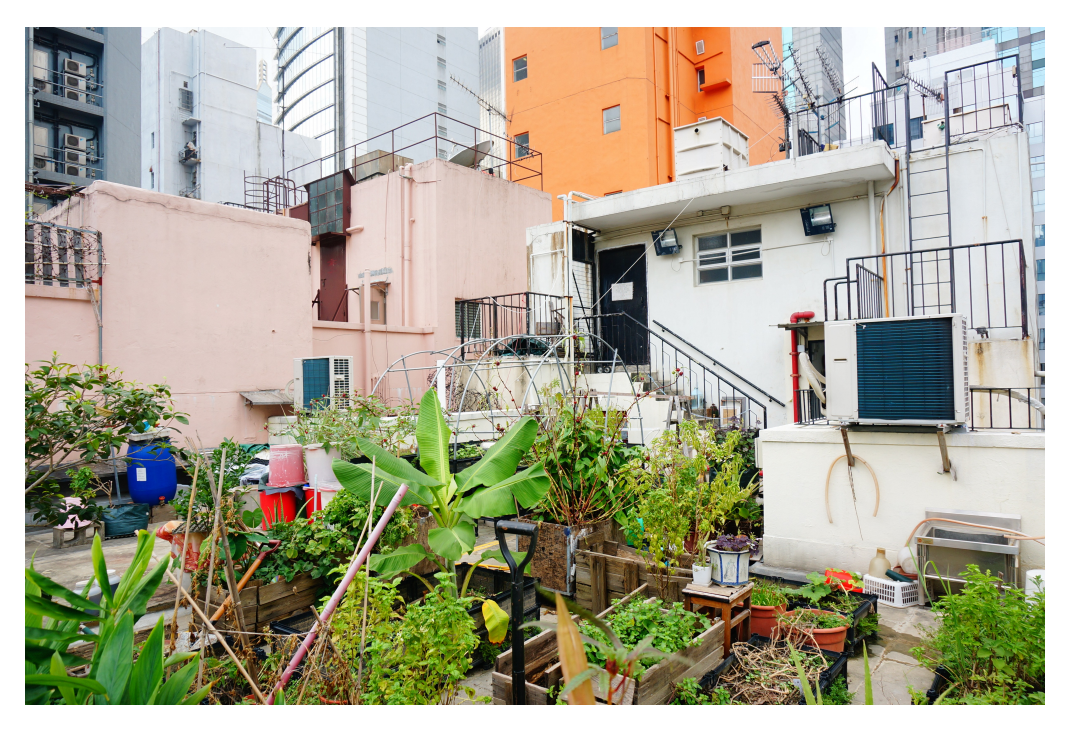
Figure 3. A rooftop farm on a multi-purpose building on Hong Kong Island.