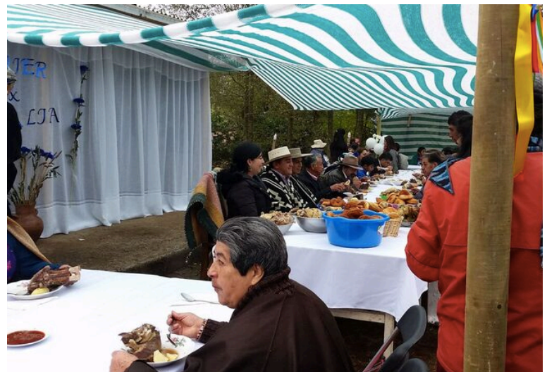
Figure 18: The sharing of slaughtered horse, a traditional practice at Mapuche weddings