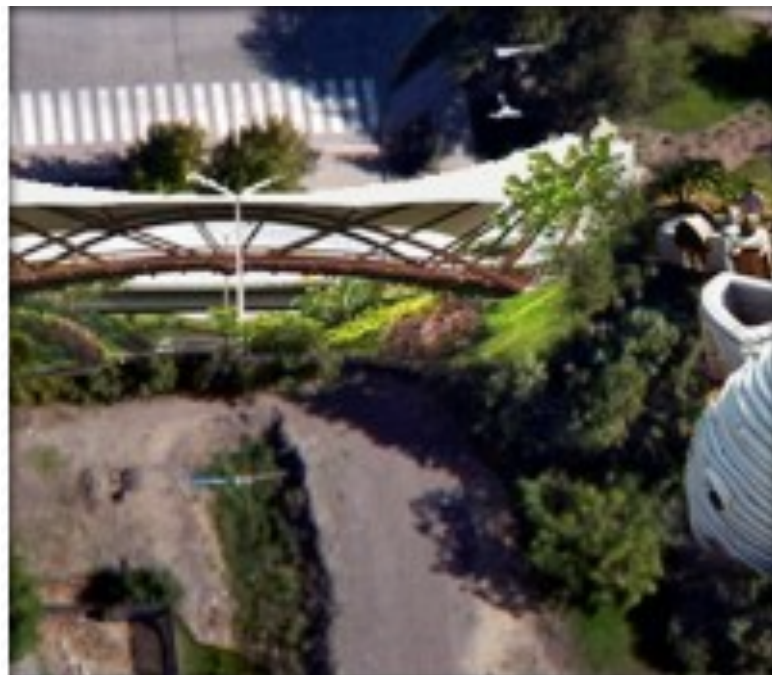
Figure 16: The proposed ceremonial centre in Santiago

Many Mapurbe respondents also celebrate the fact that they avoided being sent to boarding schools in Temuco away from their communities like many young Mapuche. This allowed them the opportunity to remain within their created urban community and to be educated within this about Mapuche culture. As one respondent explains: