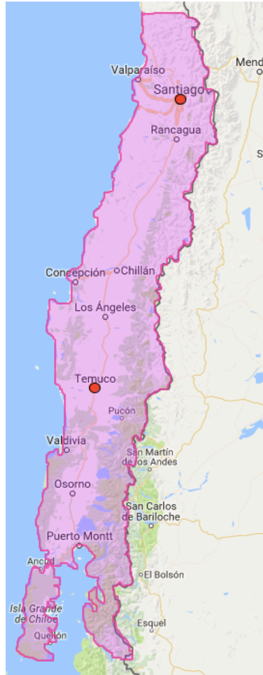
Figure 20: Map marking Wall Mapu, the original Mapuche territories.