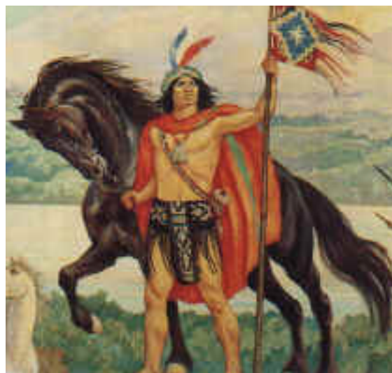
Figure 12: This image is another representation of Lautaro. Many of the representations of Lautaro were based on this same painting, painted by the Chilean painter Pedro Subercaseaux, entitled “El Joven Lautaro” (The Young Lautaro). It is one of the most famous representations of Lautaro (Francisco, 23)

Lautaro is one of the most important characters in Mapuche history. He led the Mapuche people and was a true warrior. He represented the Mapuche values in the olden days. He was strong and brave. Even though the Spaniards had armour and everything, Lautaro fought and won with just basic weapons. If there were warriors like him now, we might have got our lands back. But now people are just too lazy to fight really. ( Francisco, 23 ).