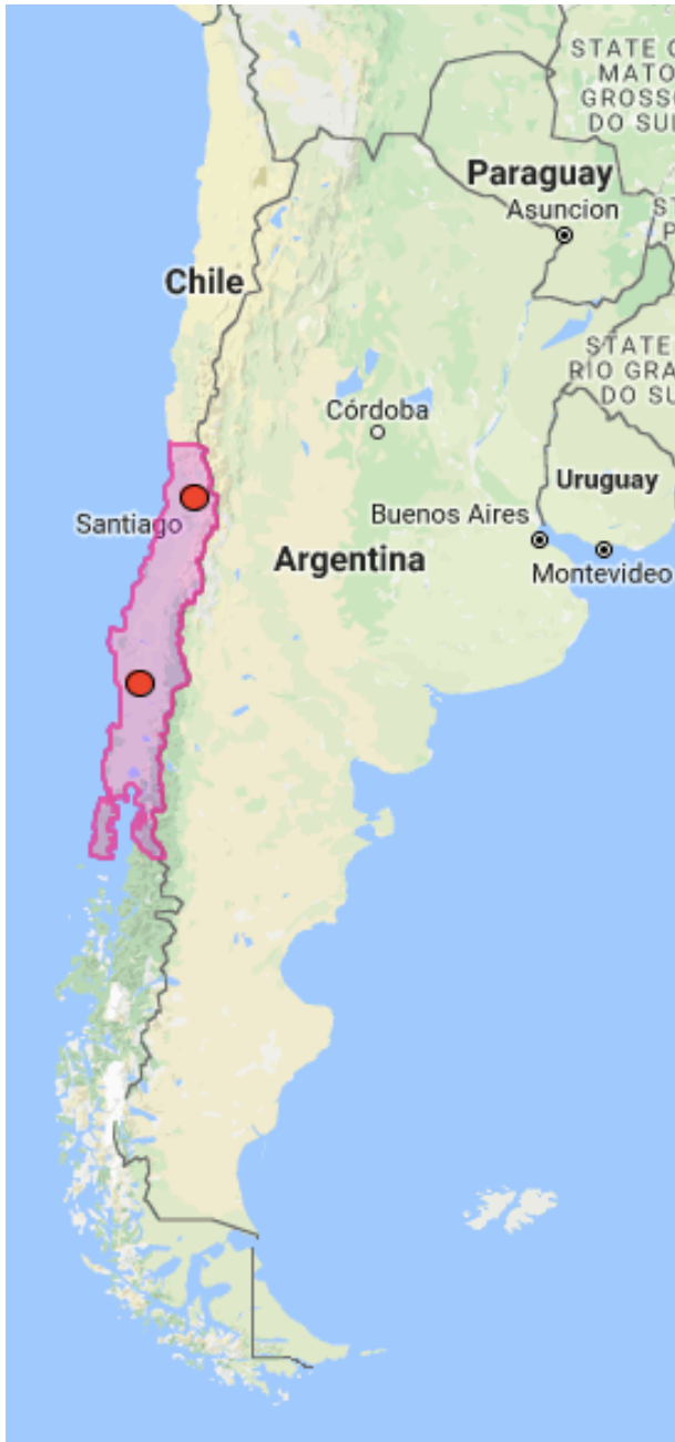
Figure 19: Map marking Wall Mapu, the original Mapuche territories.