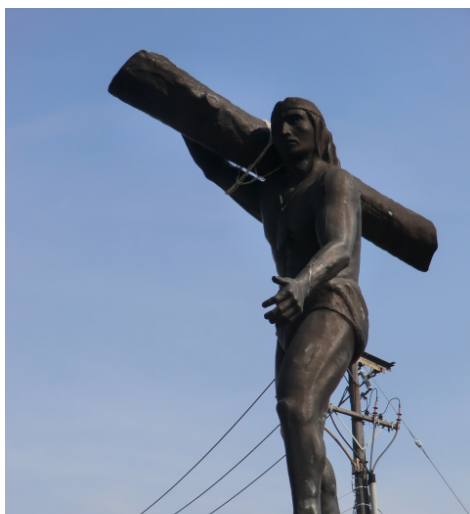
Figure 10: Photograph of a Statue of Caupolican (Vincente, Focus Group 2)