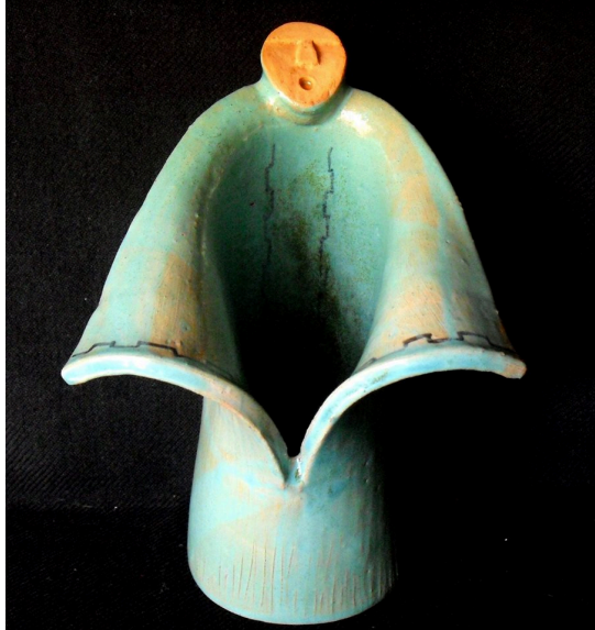
Figure 6: Photograph taken “Wentru Singing” (Franco, 29)

neighbour, a cousin comes to help. We all go to help and then they would come and help you. (Franco, 29).