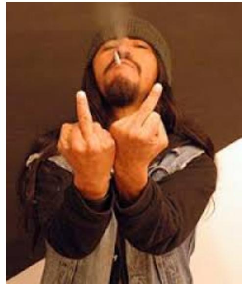
Figure 2 Image taken from the internet of Mapuche poet David Aniñir (Franco, 29)