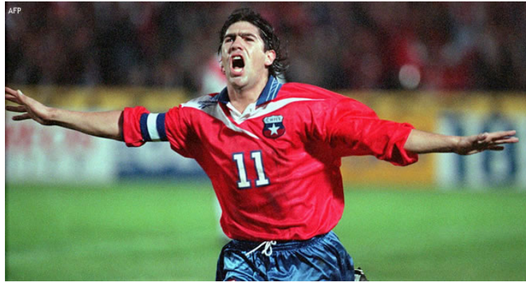
Figure 14: Marcelo Salas in the 1998 world cup playing for Chile (Alexis, 29)