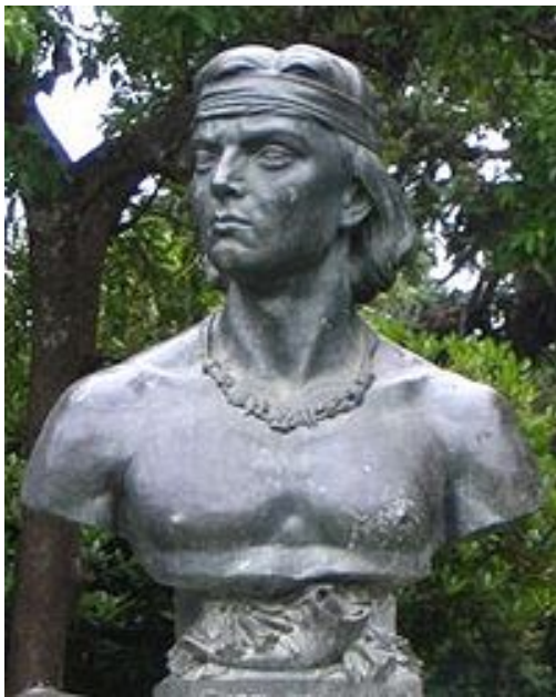
Figure 8: Image of a Statue of Lautaro (Carlos, Focus Group 4)

Vincente: I think so. Because a person with Mapuche roots, I think is much better than a person from the city. They are braver. ( Focus Group 2 ).