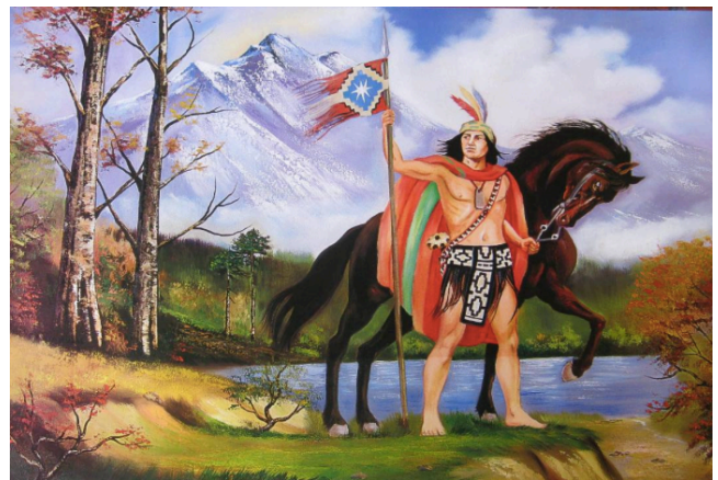
Figure 9: Painting of Lautaro (Pablo, Focus Group 2)