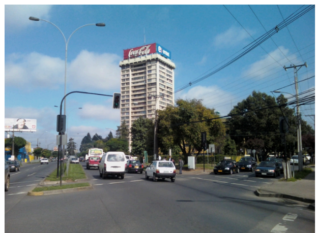
Figure 11: Photograph of Caupolican Avenue (Alejandro, Focus Group 1)