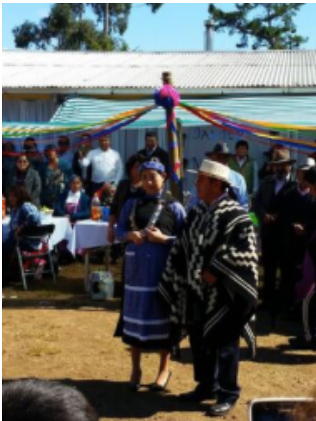
Figure 17: Photograph of the bride and groom, taken at the Mapurbe wedding

Thus, even amongst the Mapuche a hierarchy has evolved that privileges ancestral homelands as a marker of indigenous identity. Mapuche youths often reinforce dominant visions of indigenous peoples as authentic only if they live in remote areas. However, in comparison to essentialist understandings of indigenous cultures, many Southern Mapuche people do not privilege “traditional” lifestyles. For the young students I interviewed, association with place is much more important in making them Mapuche, despite how much traditional knowledge they have. Innovations that emerge from interactions with non-indigenous societies are not excluded; however, Mapucheness is homogenised by a relationship to ancestral lands (often conflated with rural areas), thus rejecting the Mapurbe as non-Mapuche because their connection to tribal homelands is sporadic, may not continue to exist, or may never have existed.