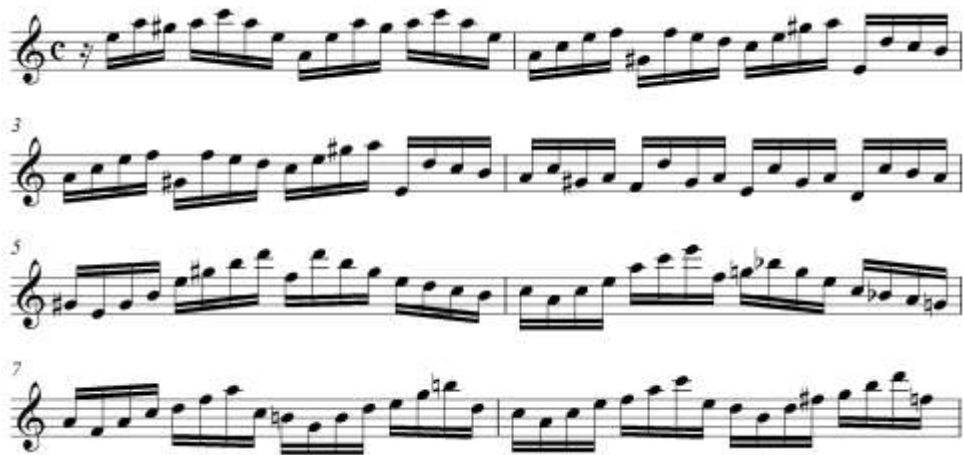
Ex. 30: J.S. Bach, Partita for Solo Flute in A minor BWV1013 , 'Allemande' bb. 1-8.

The above extract begins with a statement in A minor but by bar two the counterpoint is revealed through various sequences. Thus Alwyn might have written out the above passage as shown in ex. 31, but of course this provides only one interpretation of Bach's score, it does however illustrate the inspiration behind Alwyn's use of counterpoint in his Divertimento .