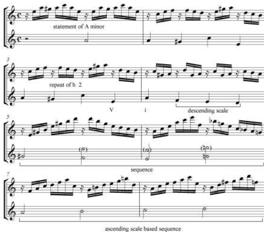
Ex. 31: Voice Separation in J.S. Bach, Partita for Solo Flute in A minor BWV1013 , 'Allemande' bb. 1-8.

The above extract begins with a statement in A minor but by bar two the counterpoint is revealed through various sequences. Thus Alwyn might have written out the above passage as shown in ex. 31, but of course this provides only one interpretation of Bach's score, it does however illustrate the inspiration behind Alwyn's use of counterpoint in his Divertimento .