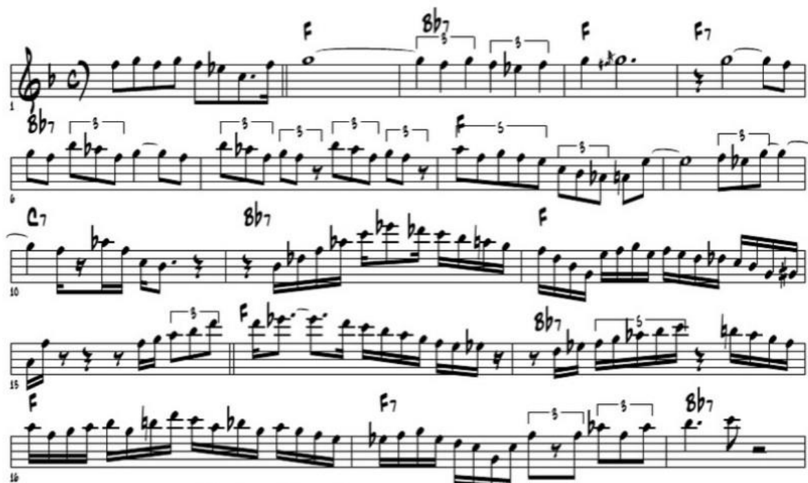
Figure 2: 'Blue Train' (1957), bars 1-18. 302

The clearest example of this exploratory approach came later in 1957 with the recording of Coltrane's second solo album, Blue Train . In terms of the trajectory of 1950s jazz, this record is interesting primarily because of its liminality—its situation on the threshold of a new aesthetic—and its unapologetic (and unreconciled) portrayal of two distinct artistic traditions. The solo on the opening track, 'Blue Train', is a case in point: