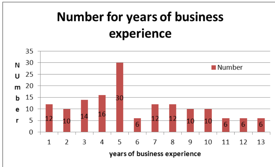
Table 2.10 Descriptive statistics of the respondents' business experience.