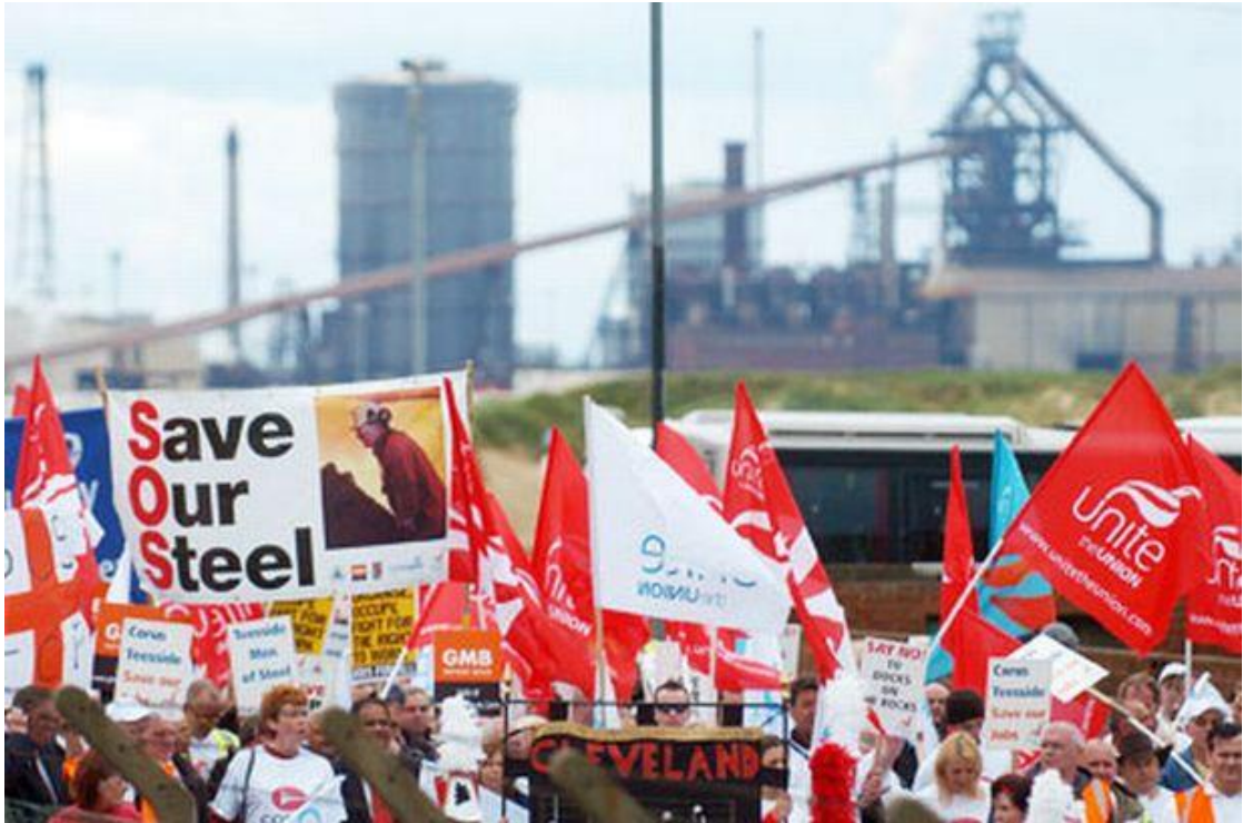
Image 5: The 'Save our Steel' march through Redcar in 2009 20 . The blast furnace is visible in the background.