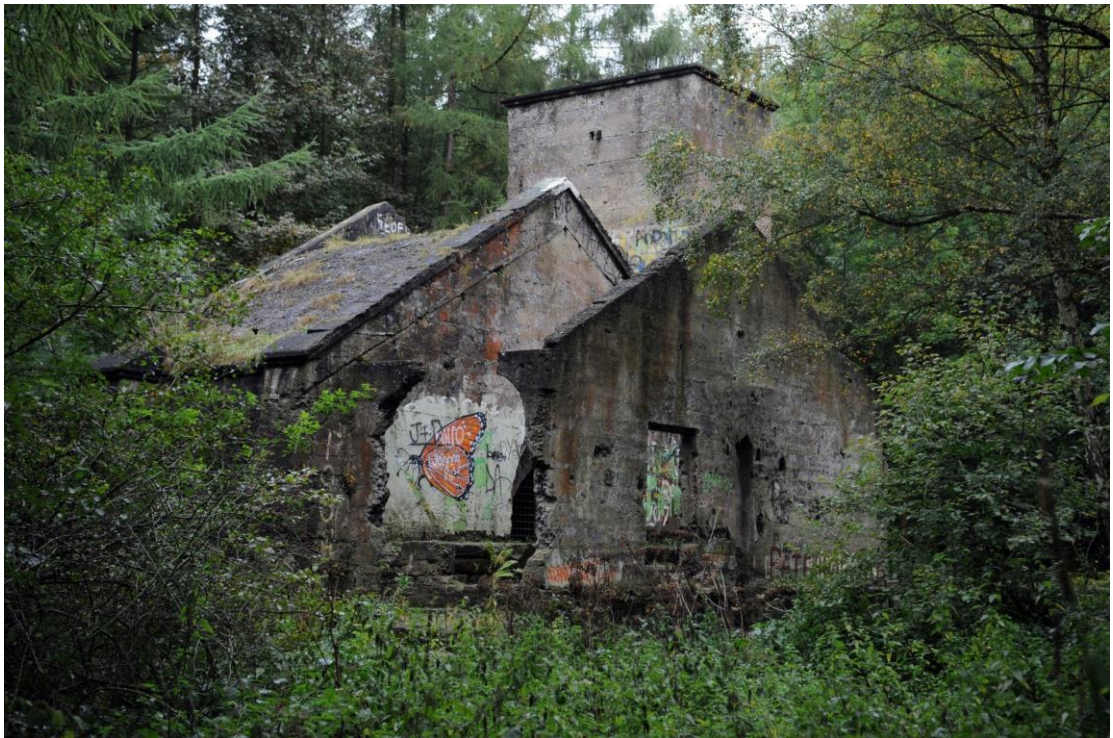
Image 2: The ruins of a former ironstone mine in the Cleveland Hills 9 .

ores, continuing the assembling of raw materials essential to the continued enactment of a future for Teesside as a site of iron and steelmaking. The last Cleveland iron ore mine closed in 1964. In the present day the half hidden and overgrown ruins of these ex-iron mines can still be found, now little more than stone foundations and bricked up drift entrances: the traces of Teesside's industrial development. In places like the Eston hills and Errington woods, it is possible to stand on the sites of these old mines - the redundant foundations to a future of iron making for Teesside - and through the trees and foliage of the Cleveland hills look out across the iron and steelmaking complex at Redcar and Lackenby and watch the steam and smoke rise from the chimneys.