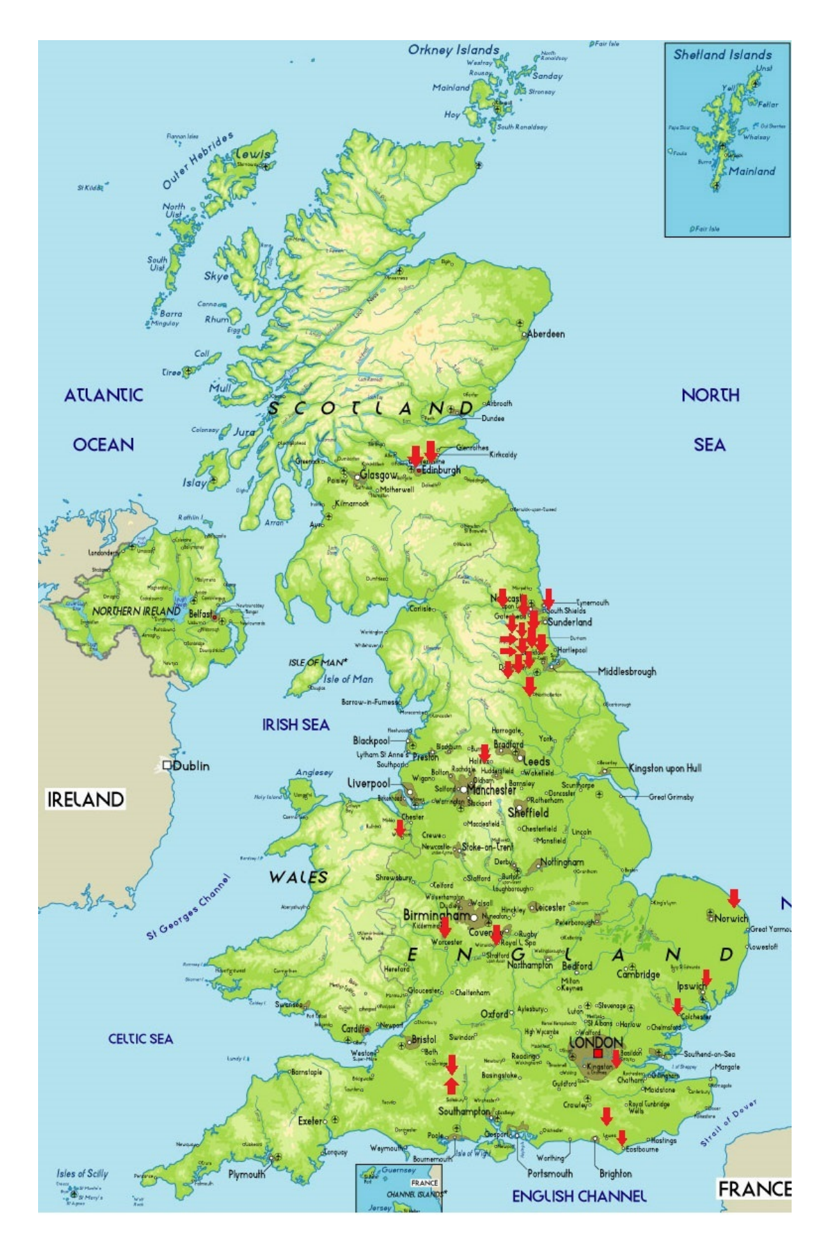
Figure 2: Interview locations.

Red arrows indicate general location of Reiki practitioner interviews.