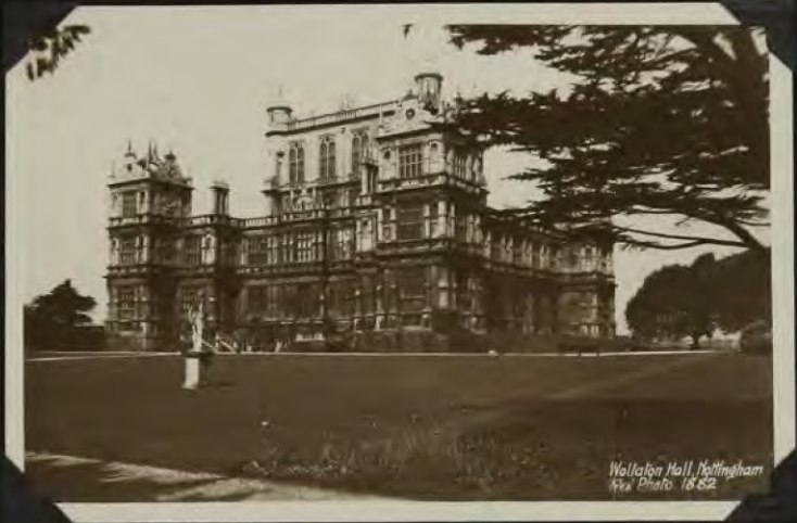
Wollaton Hall, Nottingham Real Photo 1882