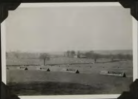
LARGE SLATE QUARRY, PASSING BETWEEN EAST KIRBY AND BLIDWORTH.