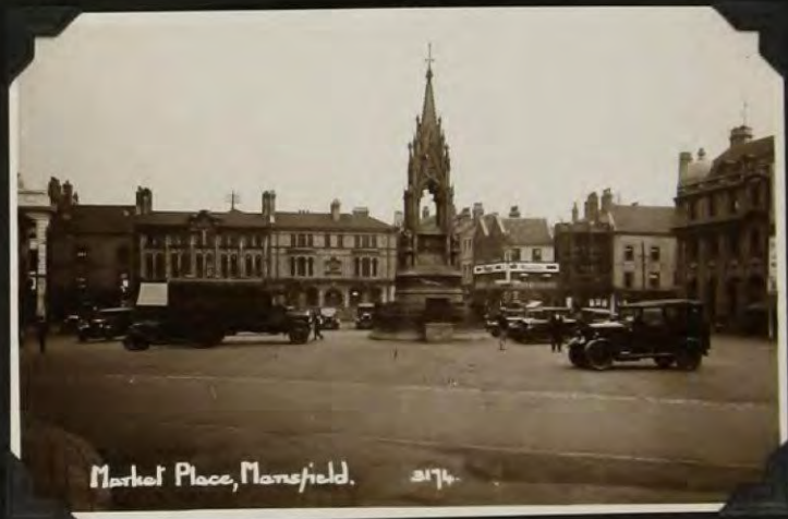
Market Place, Mansfield. 394.