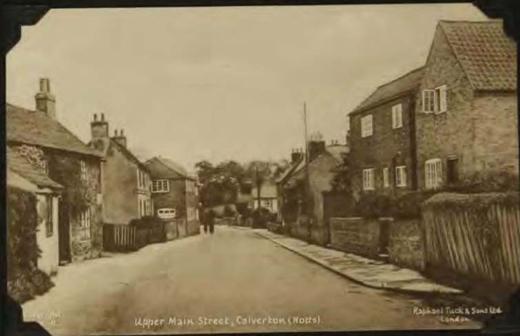
Upper Main Street, Calverton (Notts)