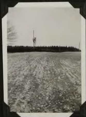
BETWEEN MANSFIELD AND BLIDWORTH, TYPICAL BUNTER FURZE BUSH FIELD SCENERY.