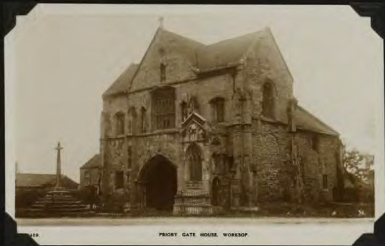
108 PRIORY GATE HOUSE, WORKSOP.