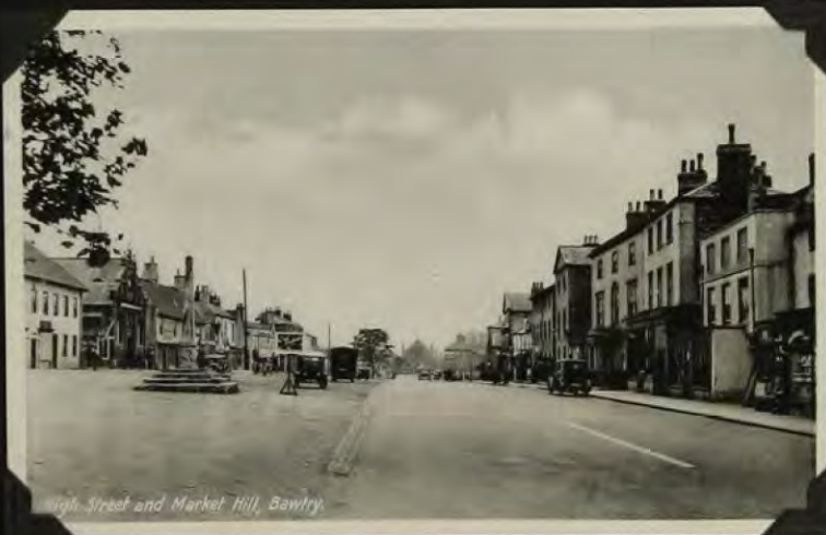
High Street and Market Hill, Bawtry.