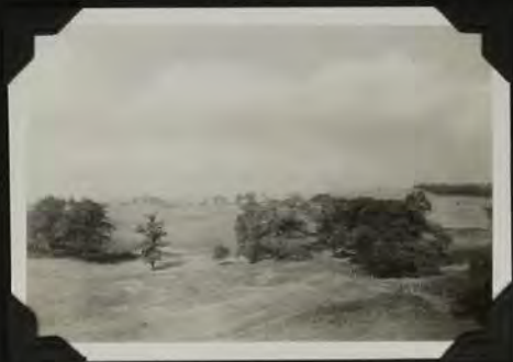
NORTH OF NEWSTEAD IN THE ROBIN HOOD'S HILLS UNDULATING BUNTER COUNTRY WITH SERIES OF DRY VALLEYS.