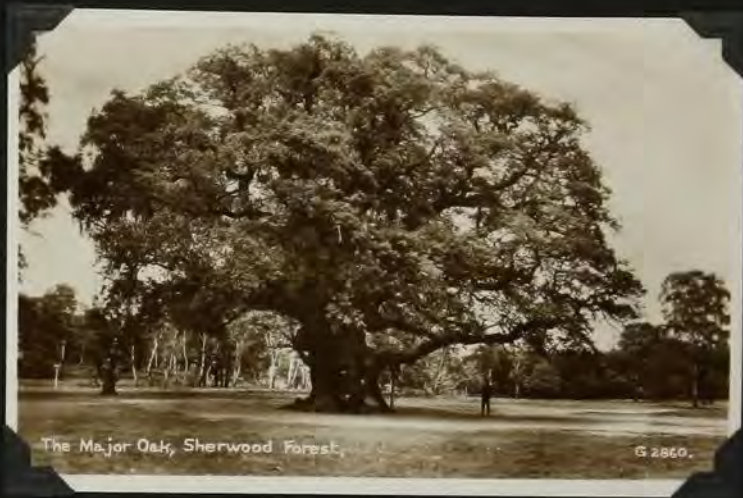
The Major Oak, Sherwood Forest.