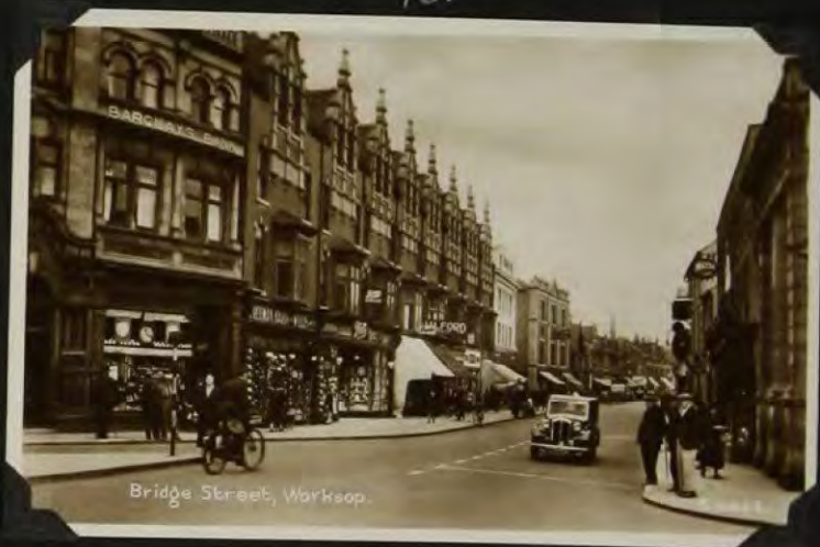
70. Bridge Street, Worksop.