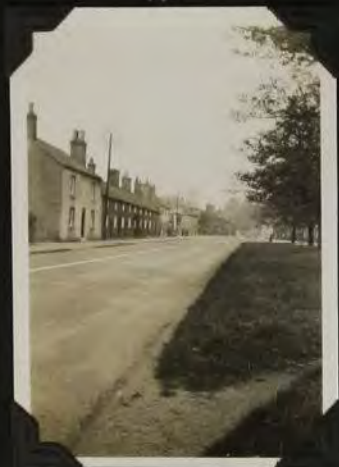
BLYTH. TAKEN FROM THE SOUTH ON THE WORKSOP - MANSFIELD ROAD.