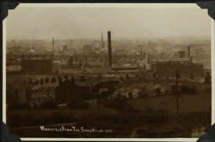
MANSFIELD FROM THE SAND HILLS 390.