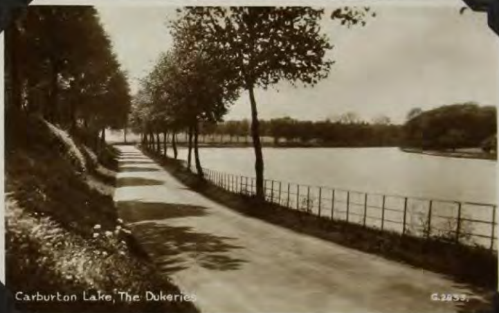
Carburton Lake, The Dukeries