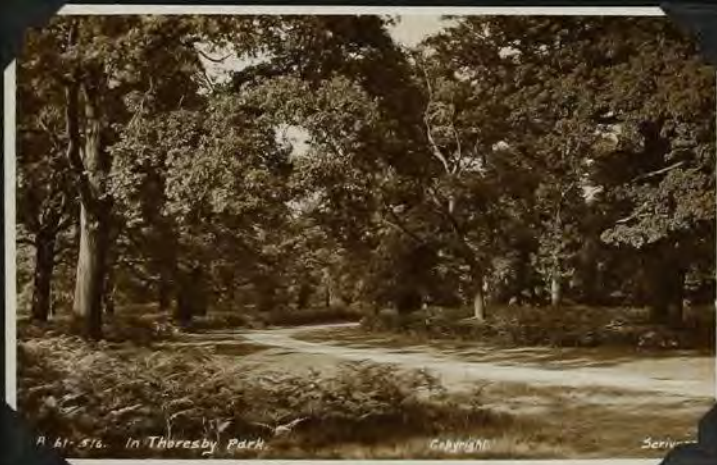
A. H. S. Co. In Thoresby Park.