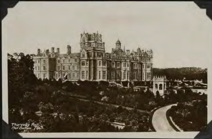
Thoresby Hall, Nottingham 1883